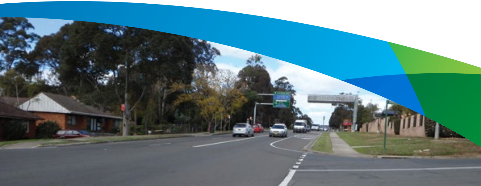
Showground Road, looking east towards Old Northern Road