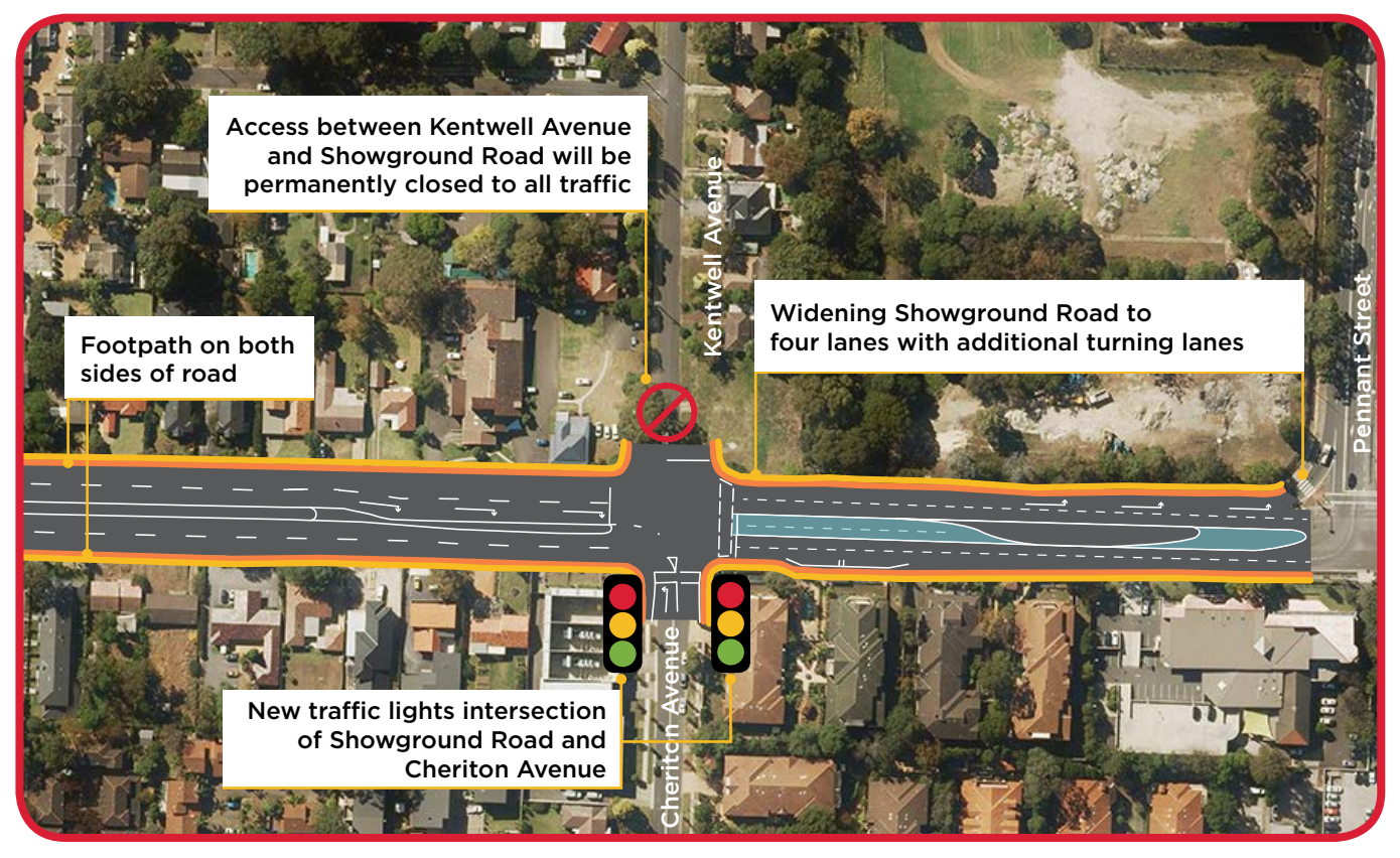
Key features of Kentwell Avenue to Pennant Street upgrade