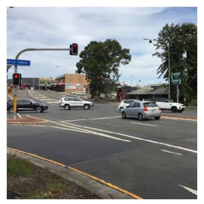
Showground Road at intersection with Pennant Street