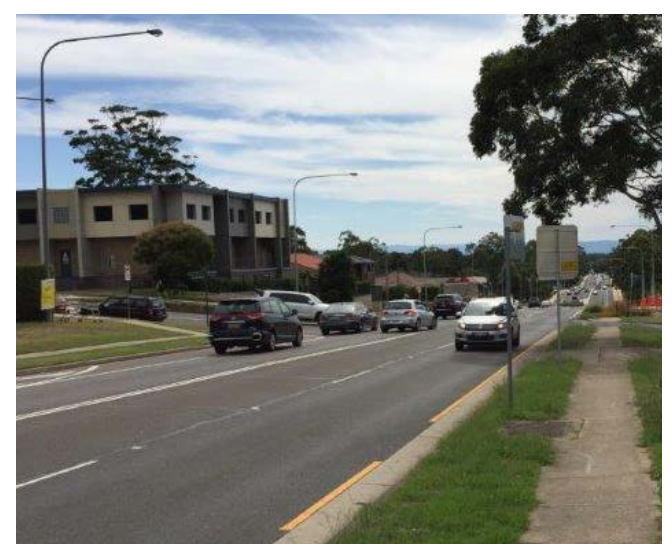
New traffic lights will be installed at the intersection of Showground Road, Kentwell Avenue and Cheriton Road