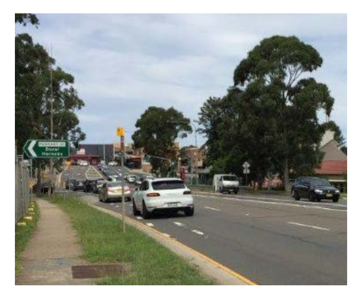
Showground Road between Kentwell Avenue and Pennant Street looking east