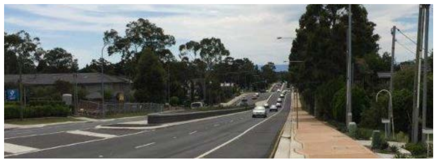
Completed section of Showground Road between Kentwell and Cecil Avenues