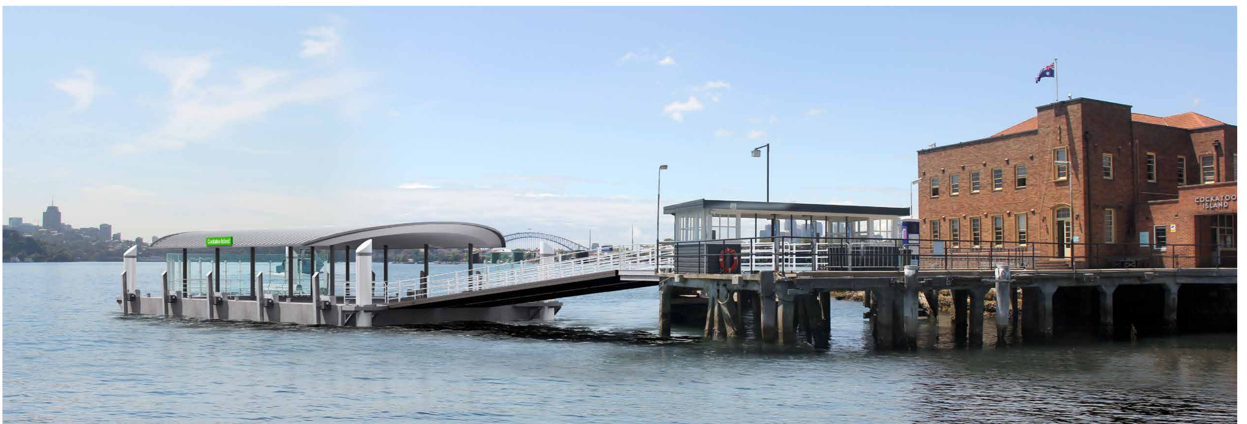
Artist's impression of the new Cockatoo Island Wharf viewed from the west

The new wharf is designed to provide customers with accessible, safe and comfortable public transport infrastructure.