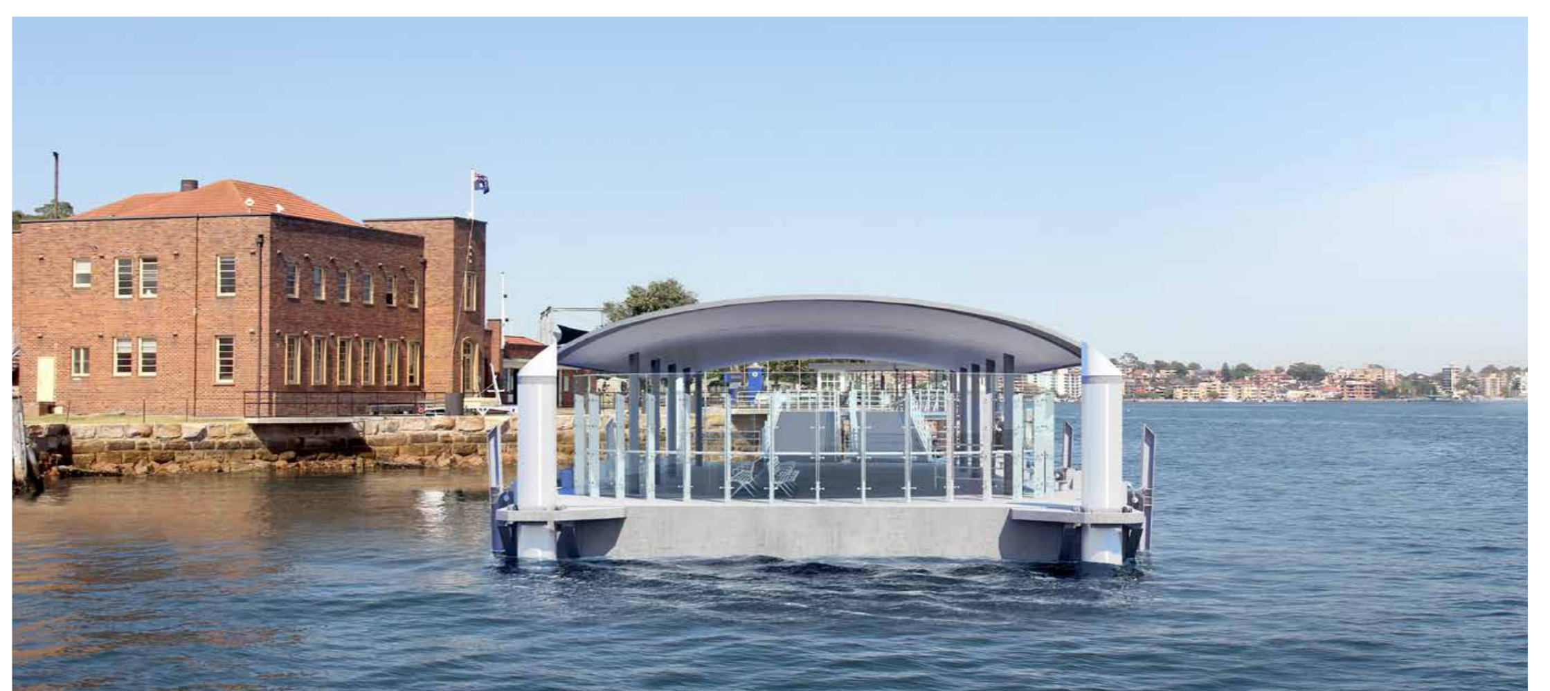
Artist's impression of the new Cockatoo Island Wharf viewed from the east