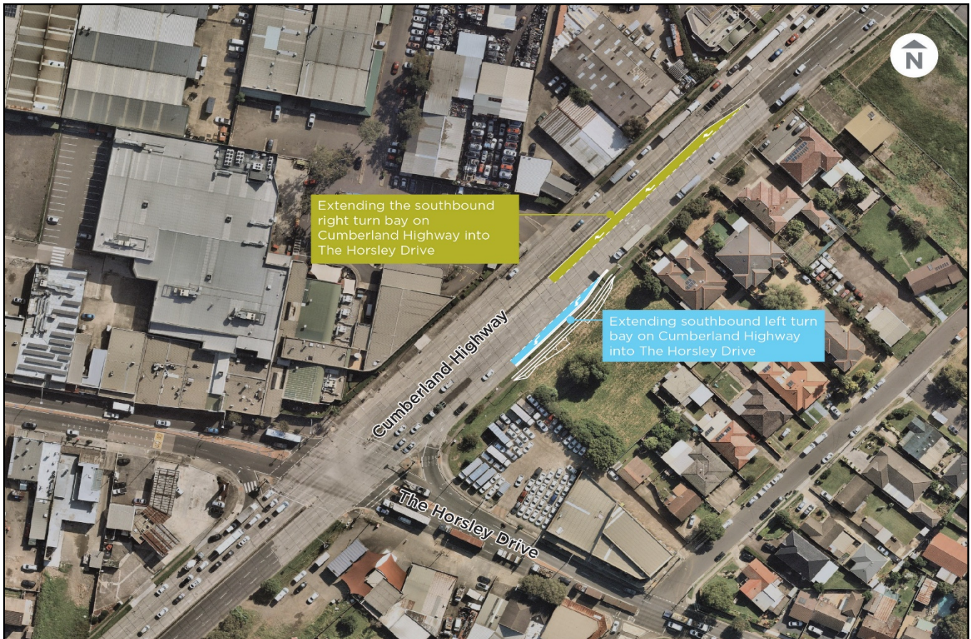
Figure 1 – proposed intersection improvements on Cumberland Highway, The Horsley Drive, Smithfield

We have included a map of the original proposal to show the location of the intersection improvements.