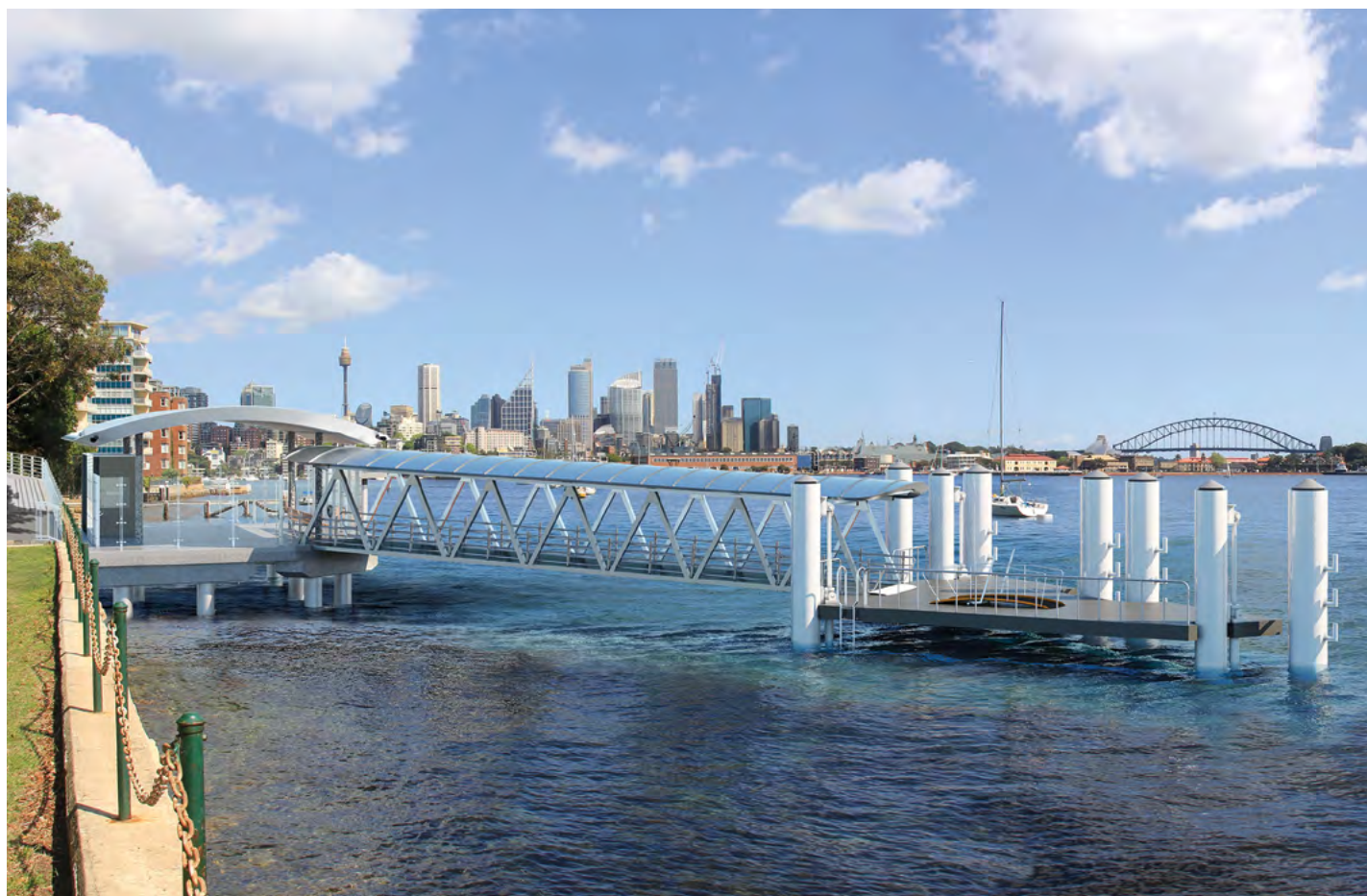
An artist's impression of the Darling Point Wharf Upgrade, view looking west

We encourage you to ask questions and give your feedback on the REF by 5pm on Sunday 29 May 2022.