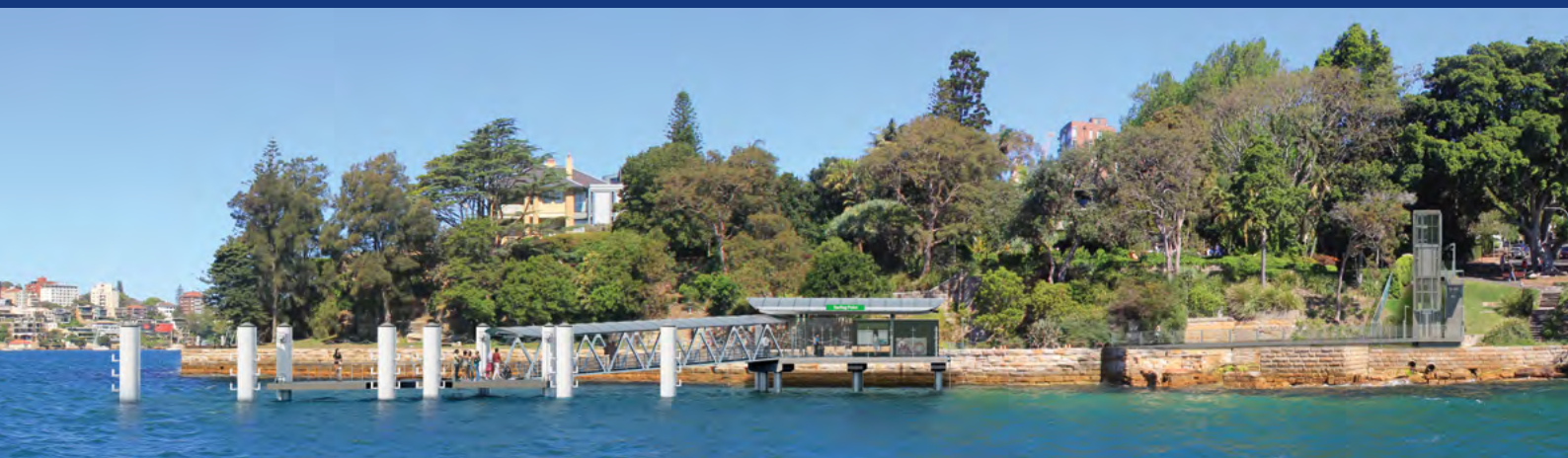
Artist's impression of proposed Darling Point Wharf Upgrade

The NSW Government is proposing to upgrade Darling Point Wharf as part of the Transport Access Program.