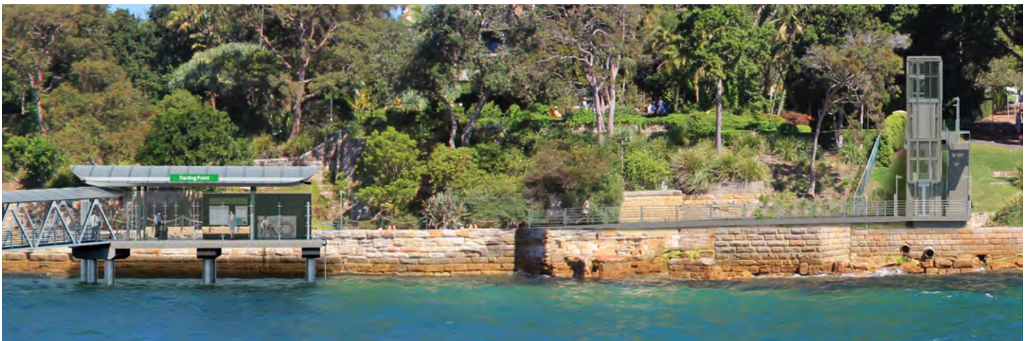
Artist's impression of the new pathway along the park foreshore connecting the lift and stairs with the waiting area

As we undertake site investigations and further develop our designs, we may need to make changes. We will keep the community updated on the results of the investigations.