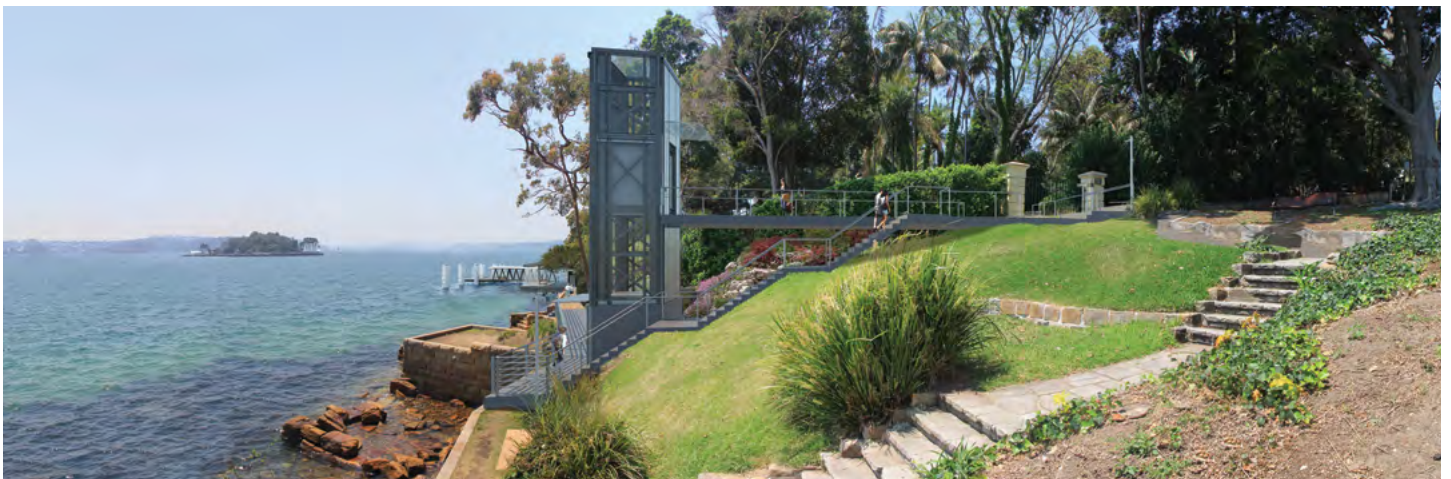
Artist's impression of proposed Darling Point Wharf Upgrade, view looking east. Pictured is the glass wall lift option and new path along the foreshore