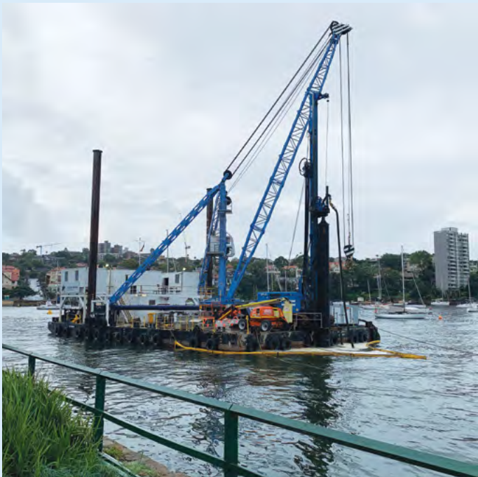
During construction we will use on-water equipment, like what is pictured here, to install the new piles

We do not anticipate any impacts to vegetation or to the McKell Park access point from Darling Point Road.