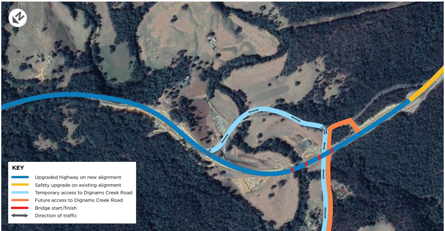
Temporary access to Dignams Creek Road via Princes Highway