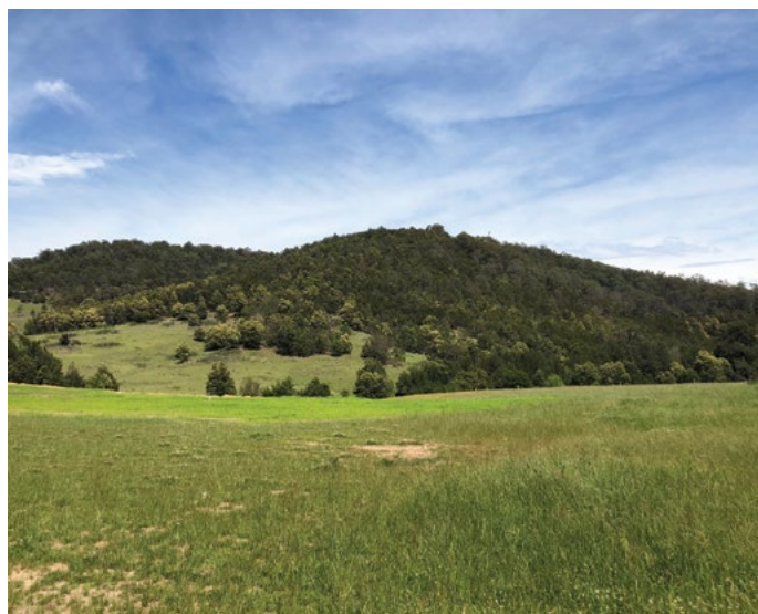
Improved land at Cobargo Showground