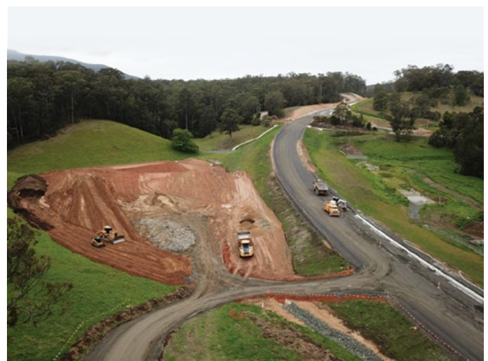
Looking north over new alignment from near Dignams Creek (November 2018)