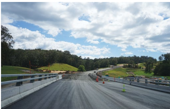
Looking north from the new Dignams Creek Bridge before traffic moved (December 2018)