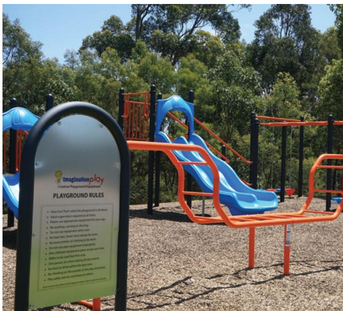
Wallaga Lake Koori Village new children's playground