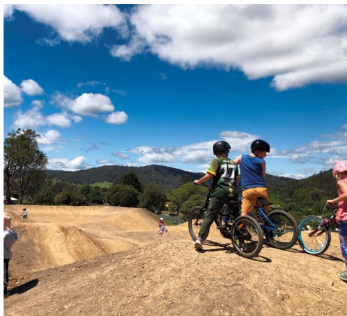
Children test out new BMX track in Cobargo