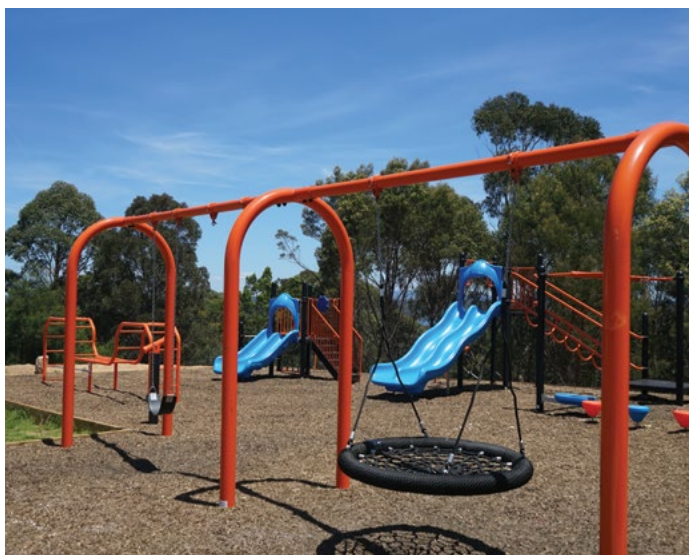
Wallaga Lake Koori Village new children's playground