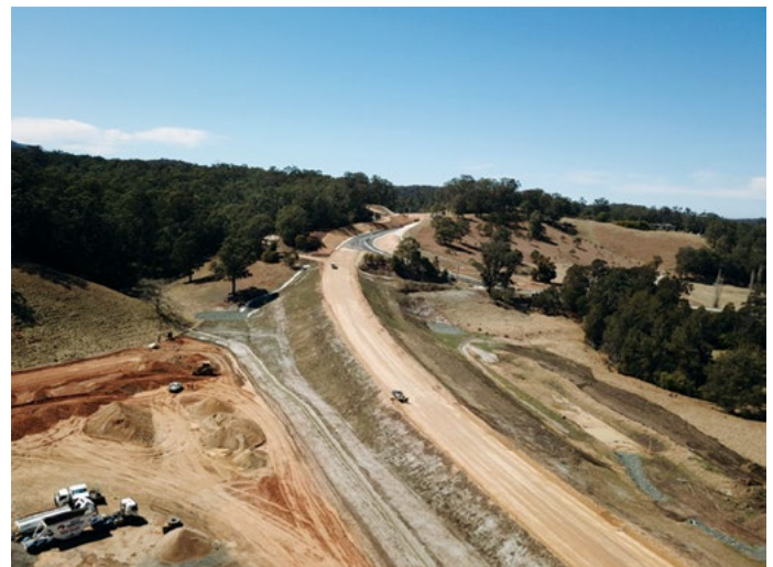
Looking north over new alignment from near Dignams Creek (September 2018)

A new wildlife underpass has been installed to connect Kooraban National Park and Gulaga National Park as part of the project.