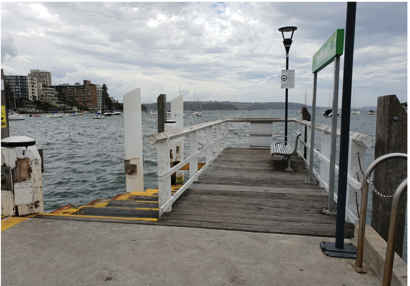
The existing Double Bay Wharf.

Ferry services to Double Bay Wharf would be interrupted during the construction of the proposed wharf. Every effort would be made to lessen the disruption to the community. More information and the opportunity to provide feedback about how construction could affect you will be provided as part of the Review of Environmental Factors process.