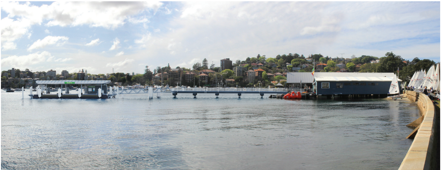
An artist's impression of the proposed Double Bay Wharf improvements.

The NSW Government is planning to improve Double Bay Wharf as part of the Transport Access Program.