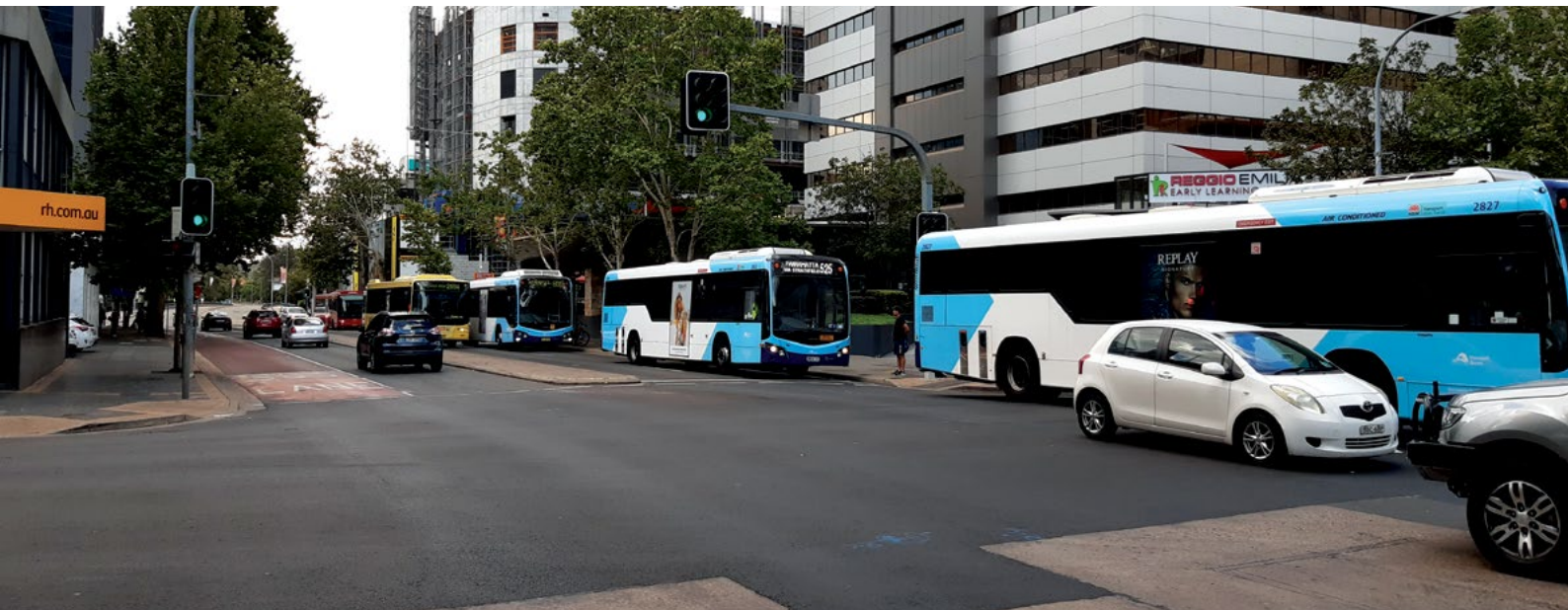
Buses on Smith Street at Macquarie Street looking north along Smith Street

The NSW Government's Bus Priority Infrastructure Program is improving the reliability and efficiency of bus services, while easing congestion for all road users.