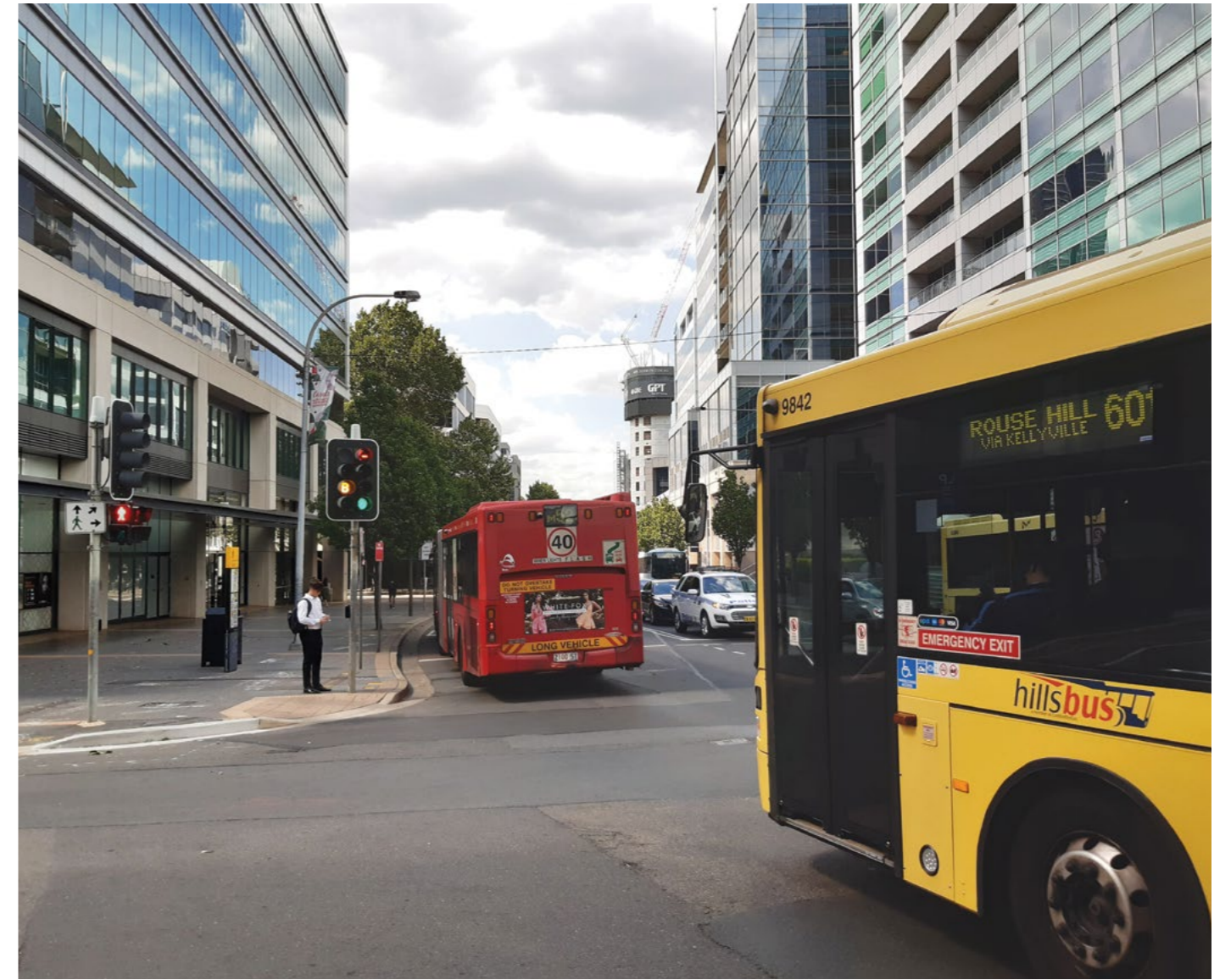
Buses on Smith Street at Macquarie Street looking north along Smith Street

Keep up to date about this project by joining our mailing list at nswroads.work/smithwilde or email buspriority@rms.nsw.gov.au