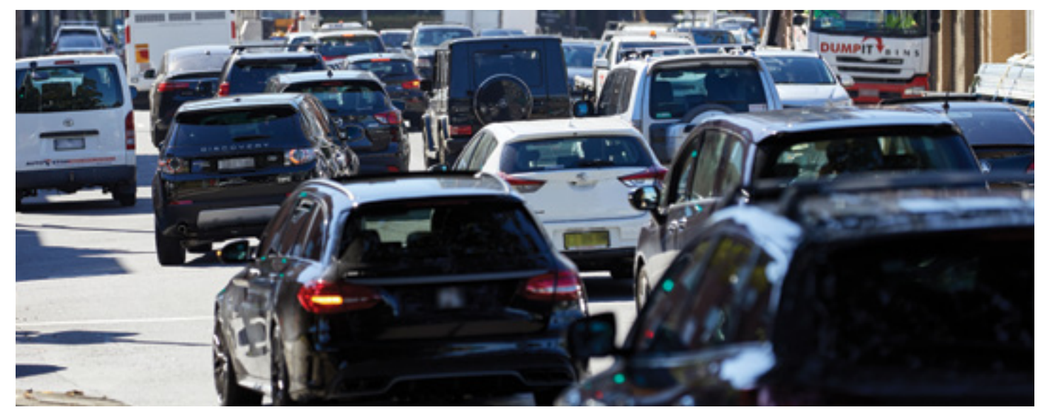
Kerbside parking contributing to congestion