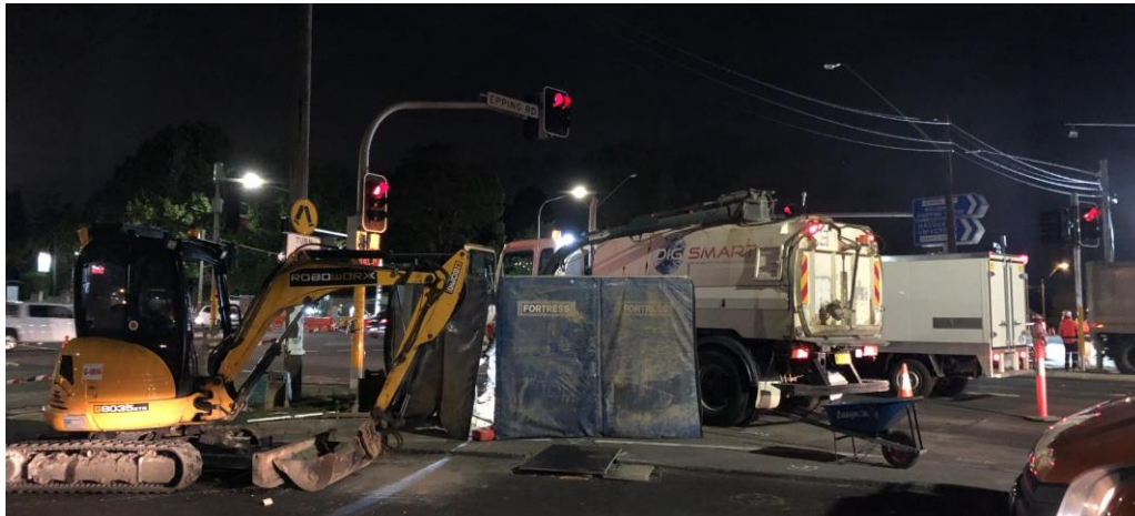
Widening work at the Herring Road and Epping Road intersection