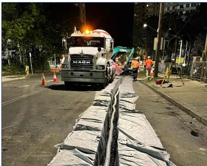
Installing drainage before adding the new layers of asphalt creates a stronger, more durable road surface