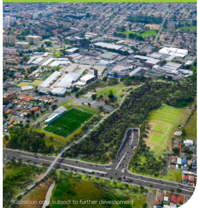
Entry and exit ramps of the F6 Extension Stage 1 tunnels at President Avenue, Kogarah.

Illustration only, subject to further development