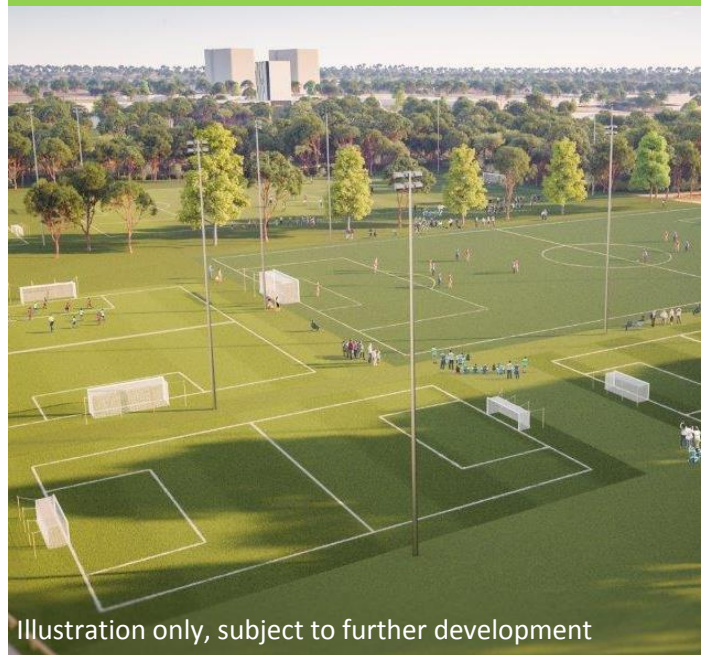
Proposed upgrade of Brighton Memorial Playing Fields

Once work is complete, we will reinstate the area by replacing soil and relaying grass. This may lead to raised ground levels in some areas for a short period of time so please be careful.