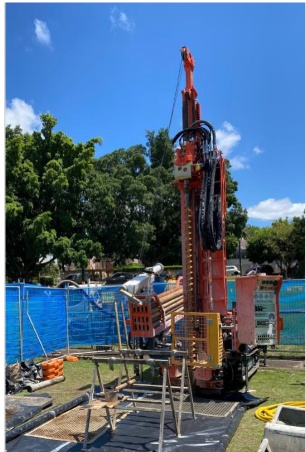
Example of a drilling rig

The geotechnical investigation activities will inform the final design for the tunnel. It will take approximately eight months to complete the geotechnical investigations across this project so once we finish in your area, you may also see us in other local areas.