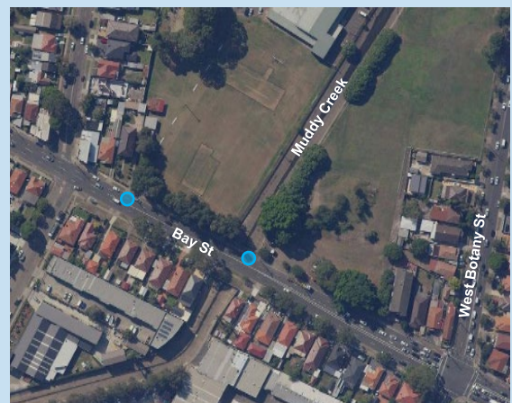
● Location of work