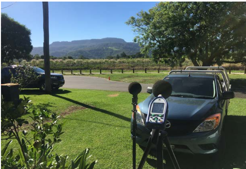
Figure 1 View of North Street noise mound from unattended monitoring location at 90 North Street

A photograph of the mound taken from the southern side is included as Figure 1. The extent of the noise mound is shown on the Figures in Appendix A.