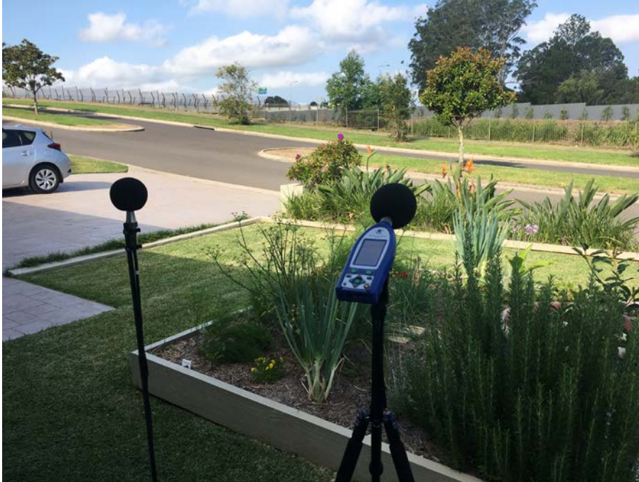
Figure 2 View of noise mound and barrier from unattended monitoring location at 8 Huntingdale Park Road

A photograph of the mound and the short additional barrier taken from Huntingdale Park Road is included as Figure 2. The extent of the Huntingdale Park Road noise mound is shown on the Figures in Appendix A.