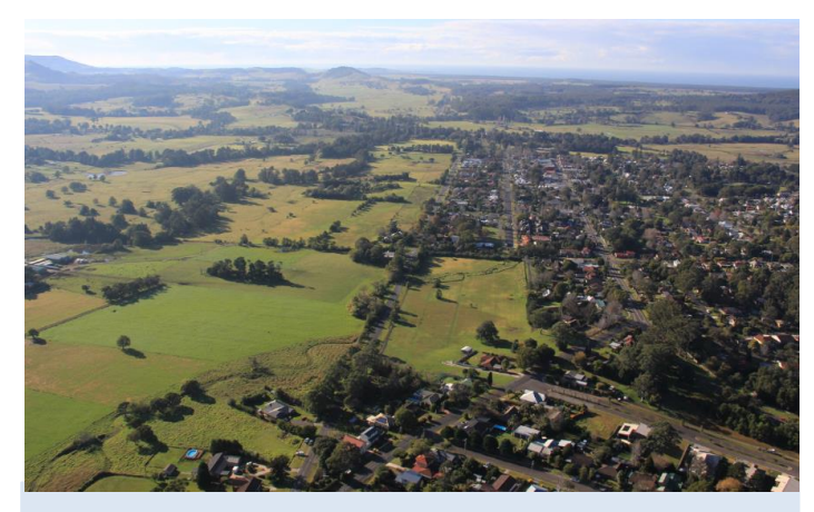
Major construction has started on the Foxground and Berry bypass with work to be completed in mid 2018, weather permitting.

The rest area on the Princes Highway north of Berry was closed on Wednesday 25 February 2015. This allows work to start on the Berry northern interchange and the 600 metre long bridge over Broughton Mill Creek and Woodhill Mountain Road.