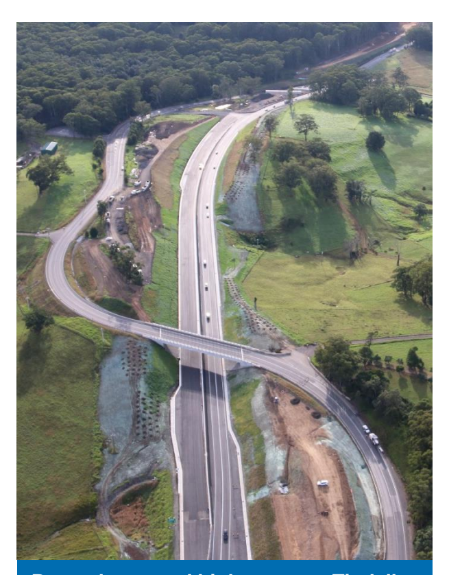
Recently opened highway near Tindalls Lane (April 2016)