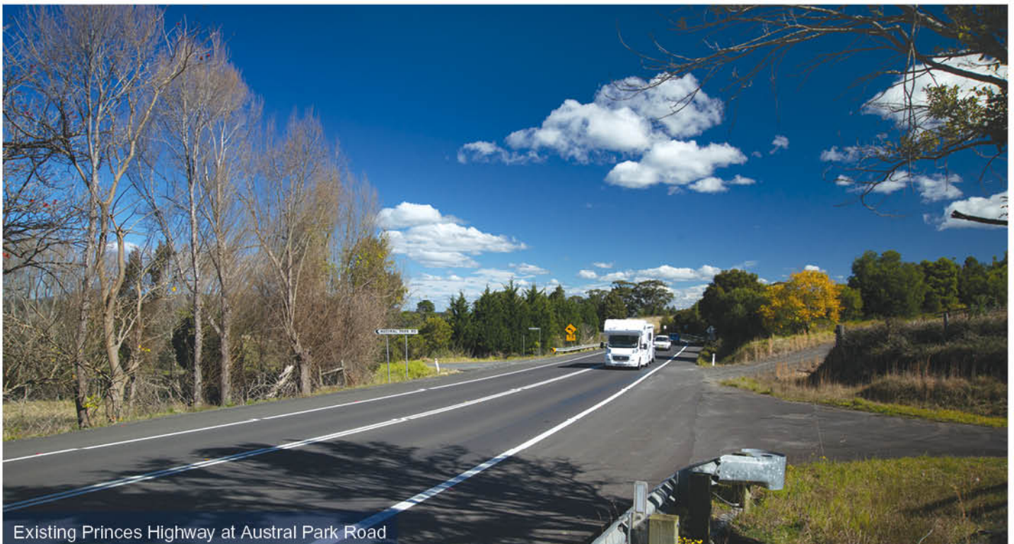
Existing Princes Highway at Austral Park Road

For further information on the Foxground and Berry bypass project, please go to the project website at www.rms.nsw.gov.au/fbb , visit the project office (open Fridays 10am to 5pm) or call the project information line on 1800 506 976 (free call).