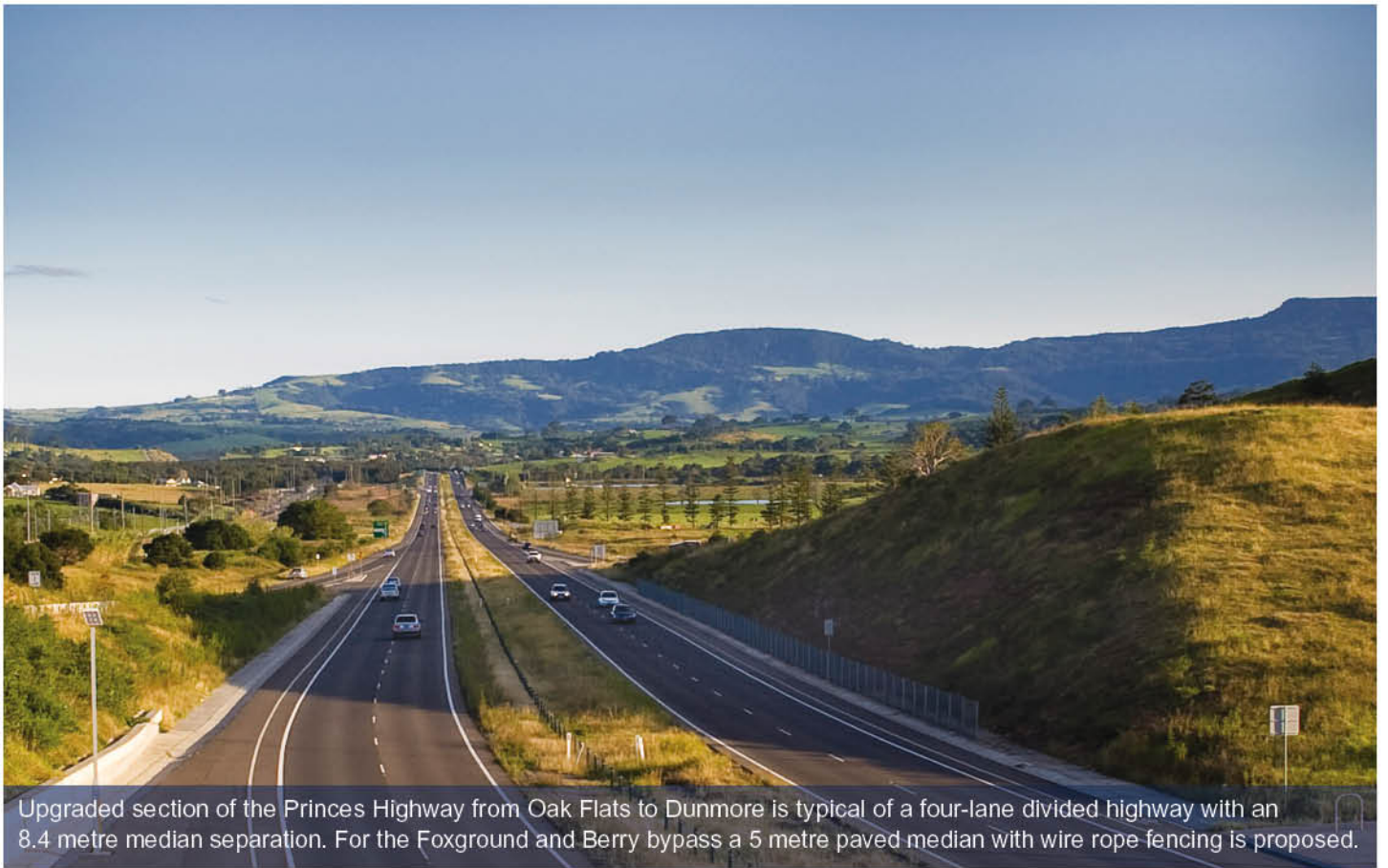
Upgraded section of the Princes Highway from Oak Flats to Dunmore is typical of a four-lane divided highway with an 8.4 metre median separation. For the Foxground and Berry bypass a 5 metre paved median with wire rope fencing is proposed.

Benefits of this project extend beyond the areas of Foxground and Berry to residents, businesses and tourists of the NSW south coast. Currently the project is the most significant proposed road infrastructure investment on the south coast.