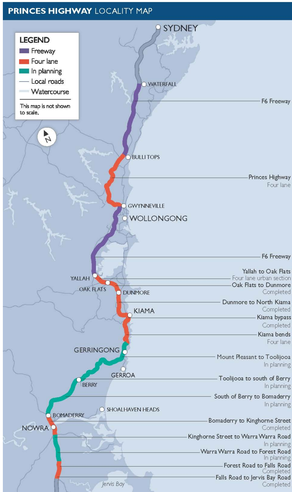
Figure 3.1: Current status of the Princes Highway upgrade