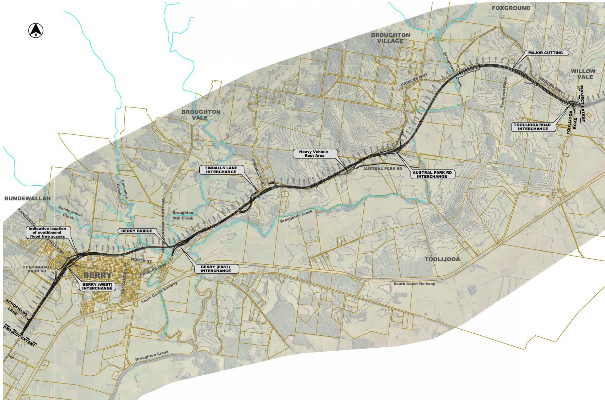
Figure 4.1: Foxground and Berry bypass project