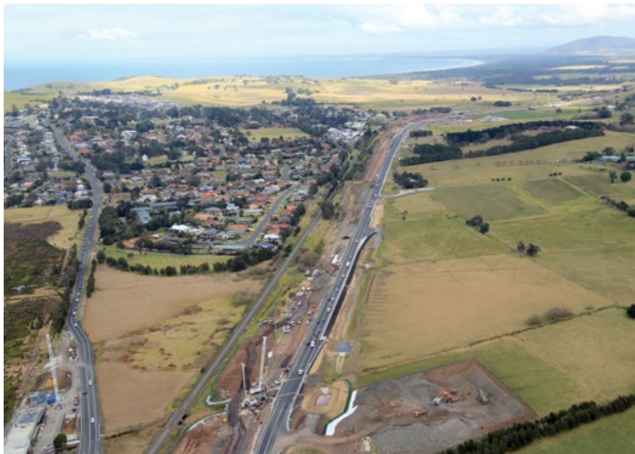
New highway adjacent to Burnett Avenue where new noise walls are being built (August 2014).

The noise walls design change has also been included into the latest design poster. To view a copy and for more information please visit the project website www.rms.nsw.gov.au/gu