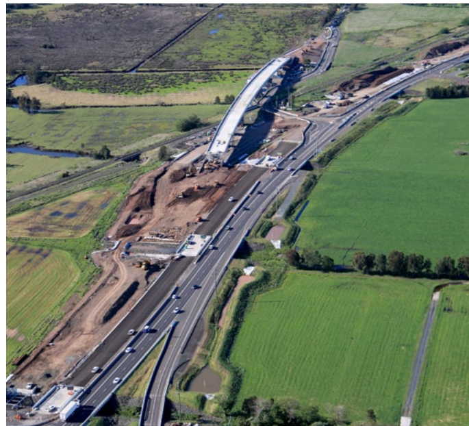
Last segment of Omega Bridge was launched in August 2014.

We have also begun planning a community event to occur before the bridge opens to traffic.