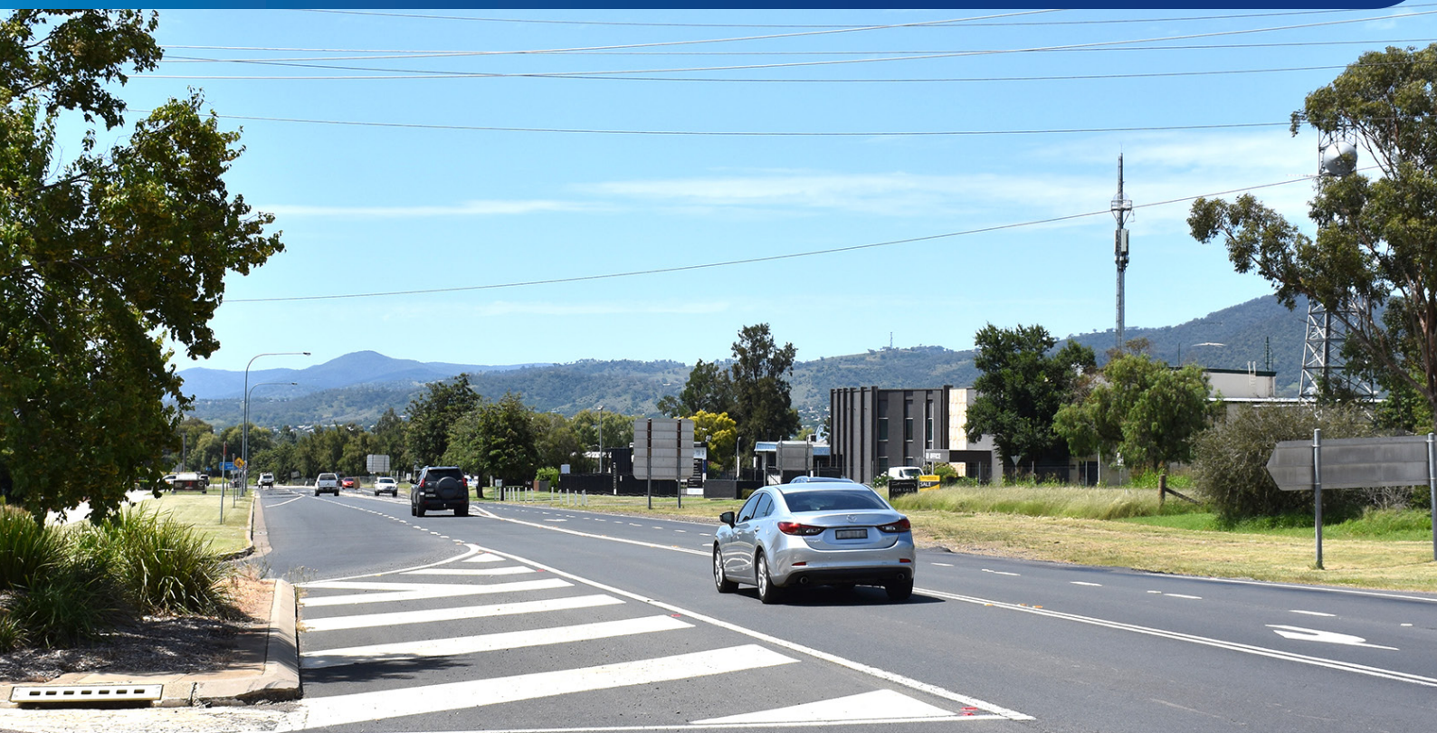
Goonoo Goonoo Road looking north from the Greg Norman Drive intersection

Goonoo Goonoo Road is an important part of the Tamworth road network, facilitating movement of local residents and freight, enabling growth and development, and providing a vital link between the regional city of Tamworth and surrounding towns and villages.