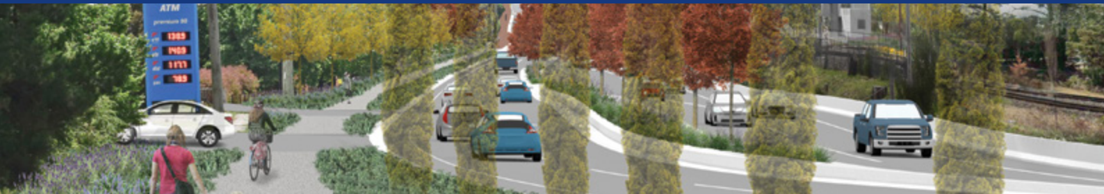
Great Western Highway Upgrade, Medlow Bath. Artist impression, subject to change during detailed design.