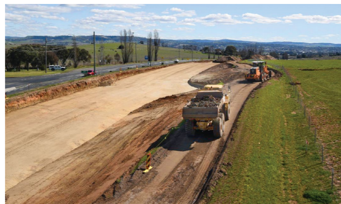
Earthworks at Raglan, looking west towards Bathurst.