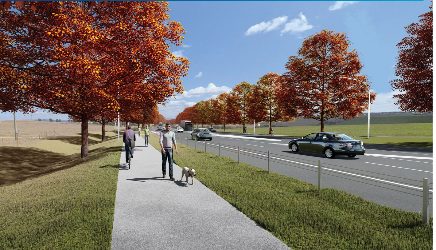
An artist impression of the completed upgrade westbound from Napoleon Street

Work is progressing to duplicate a 3.6km section of the Great Western Highway between Kelso and Raglan.