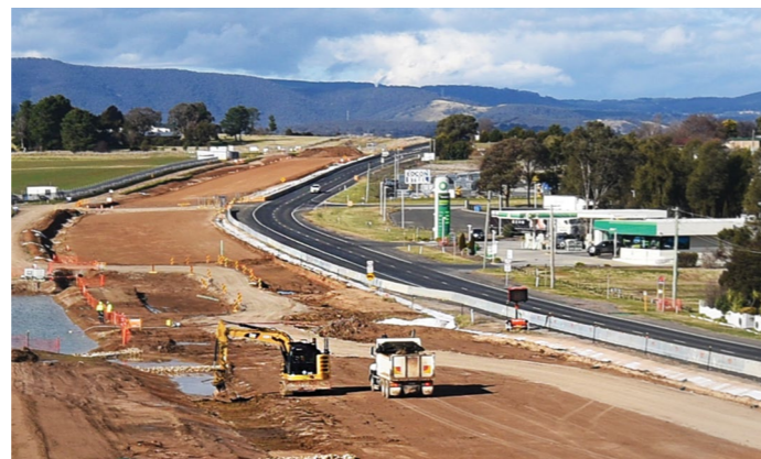
Over 16,000 tonnes of topsoil has been transferred to the former Bathurst Brick Pit wetlands.

"I am thrilled to see this previously unused site transformed into a thriving oasis for local bird populations, it's a huge win for our community."