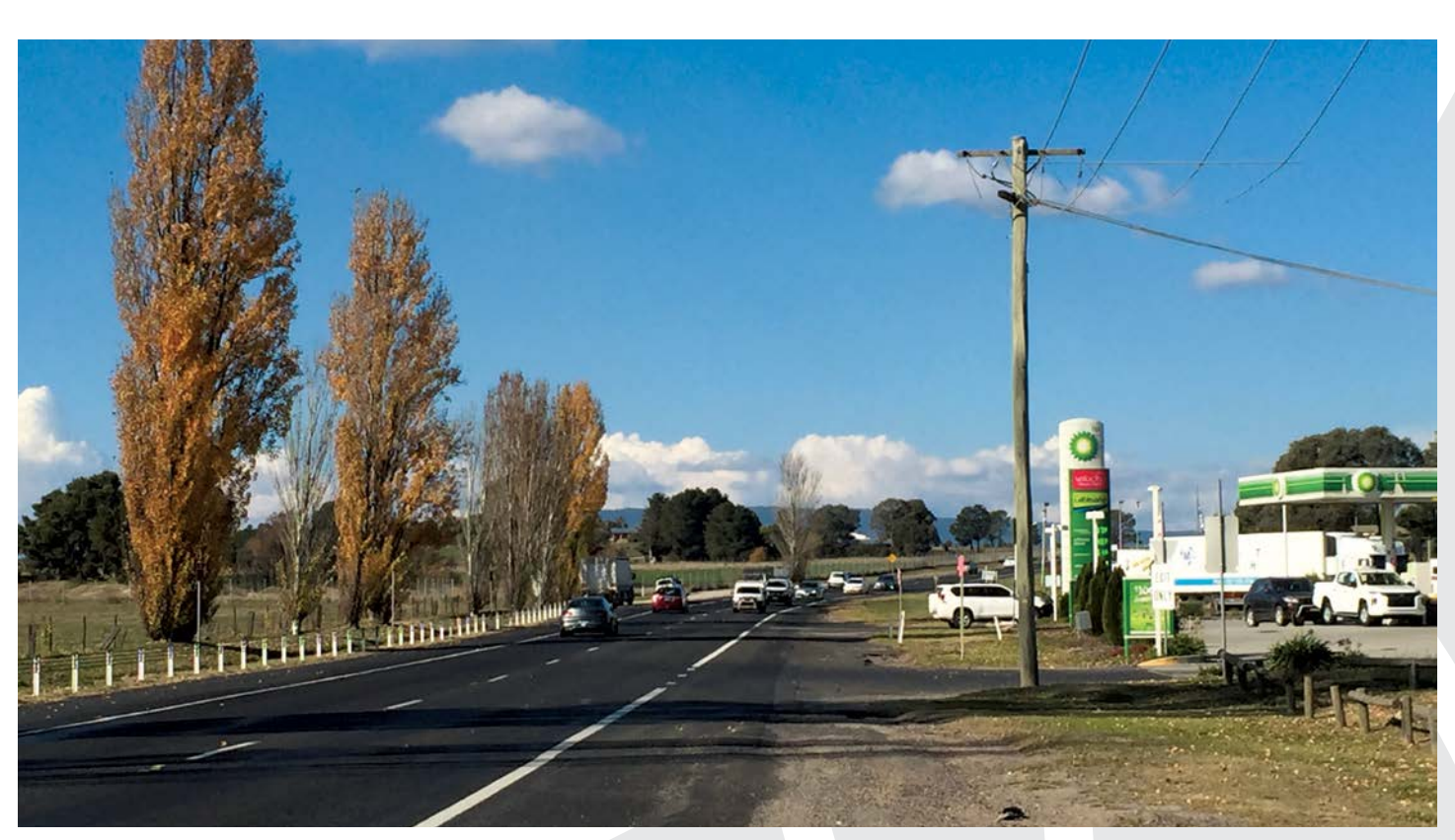
Great Western Highway at Raglan

If you need help understanding this information, please contact the Translating and Interpreting Service on 131 450 and ask them to call us on 02 6369 5423.