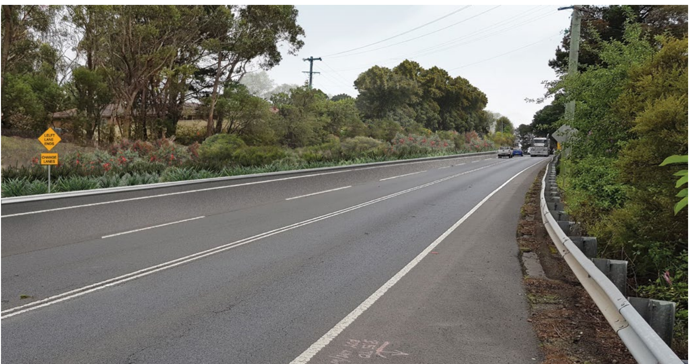
Artist impression: Screening of the cutting after the planting has matured