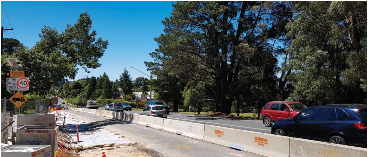
The top of Hill 33, looking north towards Prince George and Abbott Street