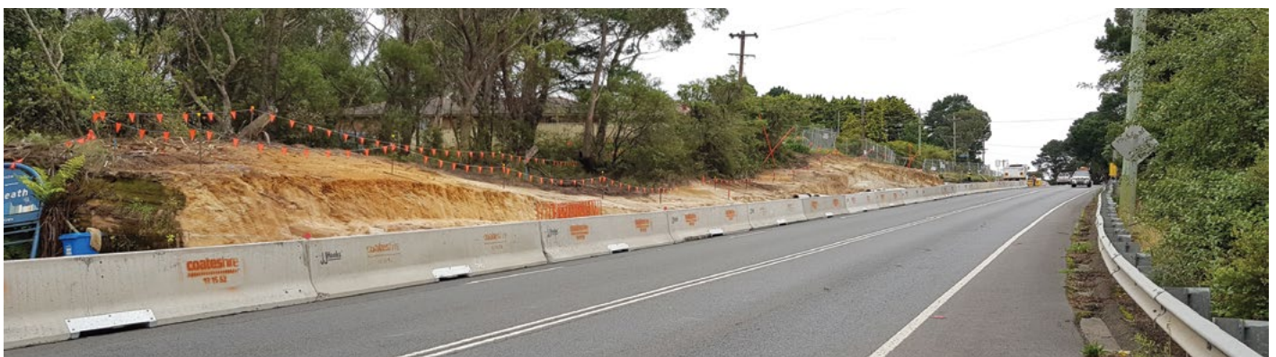
Cutting excavation at Hill 33

If you need help understanding this information, please contact the Translating and Interpreting Service on 131 450 and ask them to call us on 1800 035 733 .