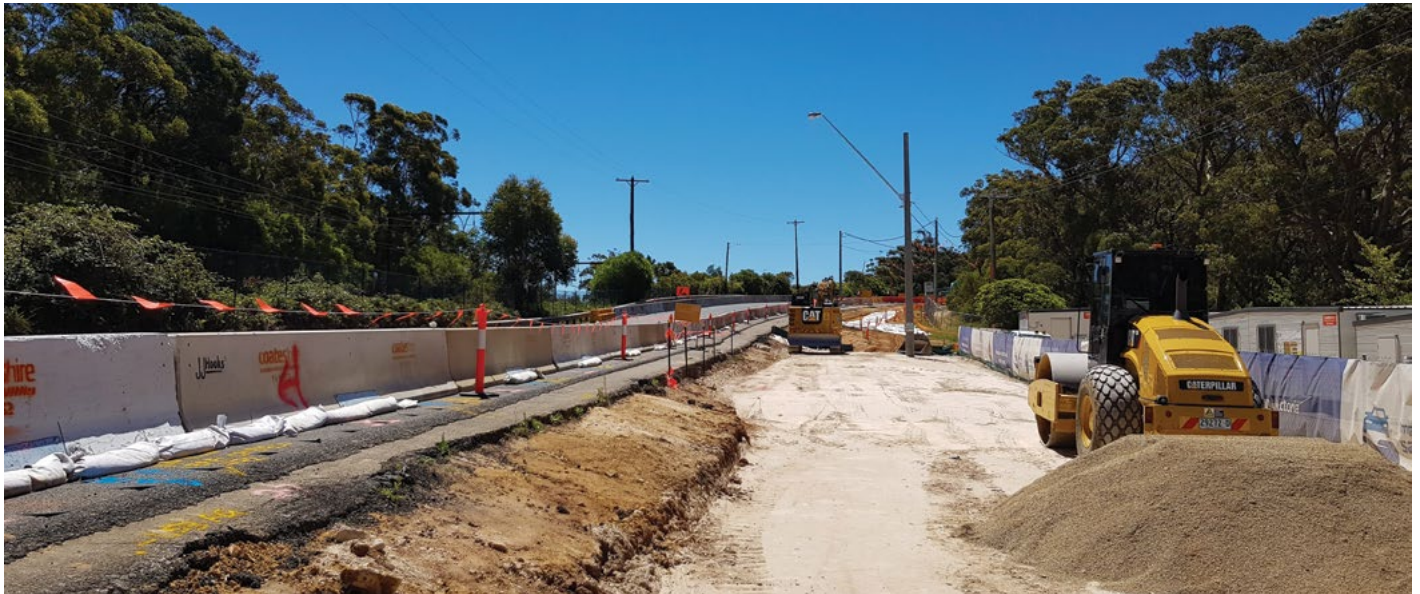
Safety upgrade work continues at Sutton Park