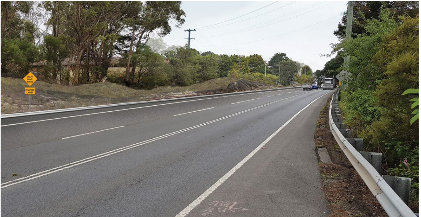
Artist Impression: Hill 33 when works are completed

Artist impressions of how the cutting will appear after the work is completed and after the proposed planting has grown are below: