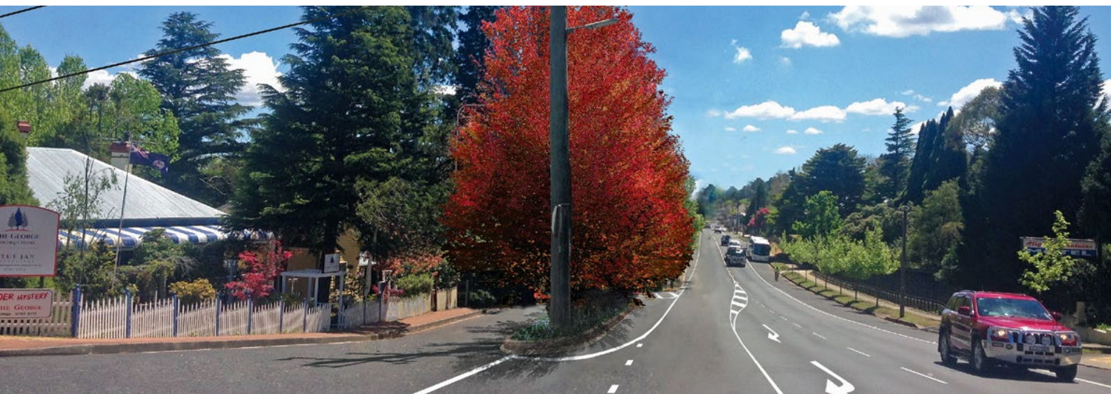
Artist impression – looking west at Abbott Street Intersection

The Australian and New South Wales governments are upgrading the Great Western Highway between Katoomba and Lithgow for easier, faster and safer travel.