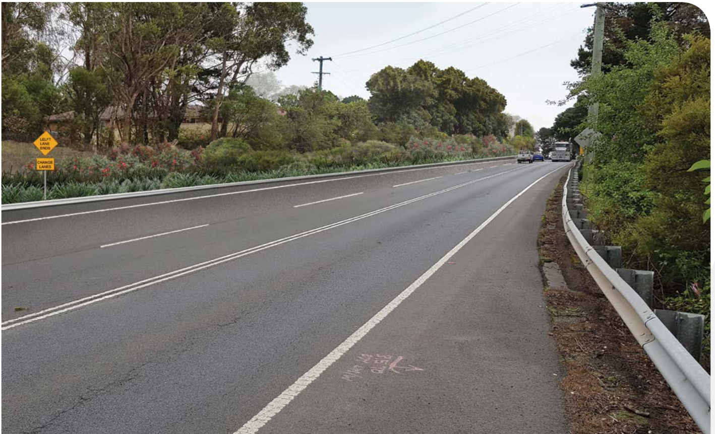
Artists impression looking west from Hargraves Street

The Australian and New South Wales governments are upgrading the Great Western Highway between Katoomba and Lithgow for easier, faster and safer travel.