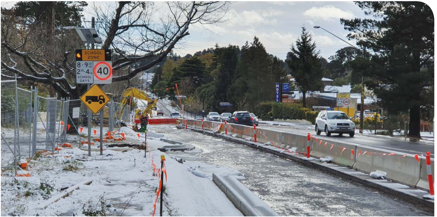
Road and kerb construction near Prince George Street looking west along the Great Western Highway