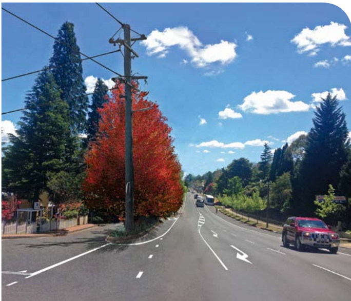
Artists impression looking west at Abbott Street intersection

If you have any questions or would like to register for future updates about the project, please contact the team on 1800 953 777 or email gwhd@rms.nsw.gov.au .