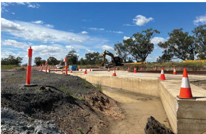
Concrete pour, April 2022

Project information and updates will be made available via the project website as well as direct communications to stakeholders