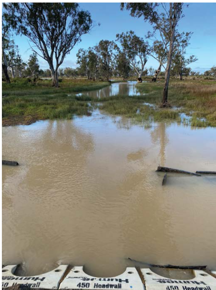
Pictured above: Flood water flowing onto job site in August 2021