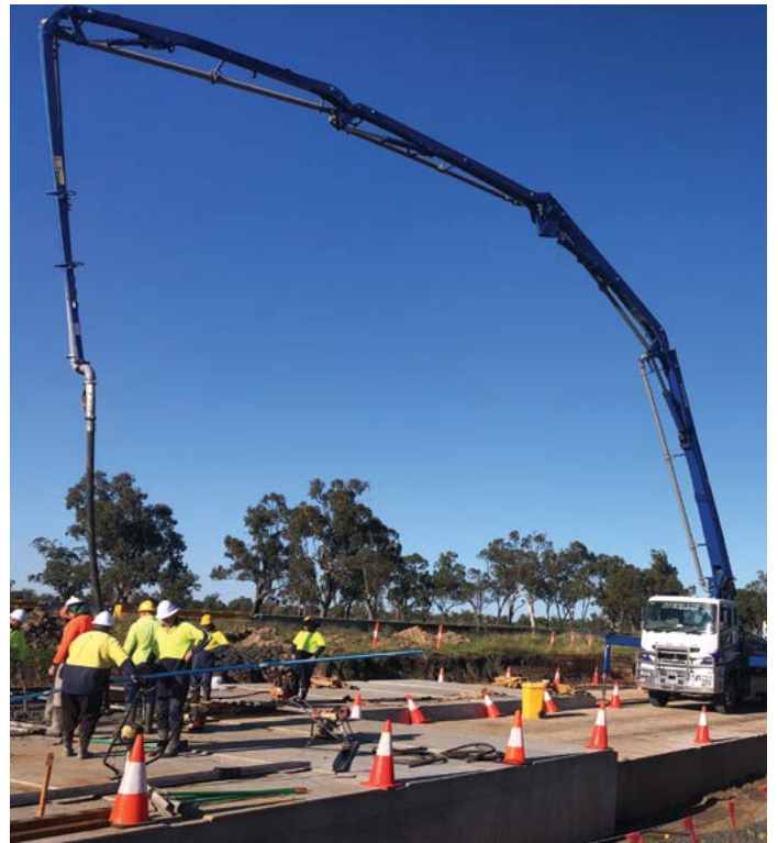
Concrete pour at the project site in April 2022

Privacy Transport for NSW ("TfNSW") is subject to the Privacy and Personal Information Protection Act 1998 ("PIIP Act") which requires that we comply with the Information Privacy Principles set out in the PIIP Act. All information in correspondence is collected for the sole purpose of assisting in the delivery of this project. The information received, including names and addresses of respondents, may be published in subsequent documents unless a clear indication is given in the correspondence that all or part of that information is not to be published. Otherwise Transport for NSW will only disclose your personal information, without your consent, if authorised by the law. Your personal information will be held by Transport for NSW at Level 1, 51-55 Currajong Street, Parkes NSW 2870. You have the right to access and correct the information if you believe that it is incorrect.