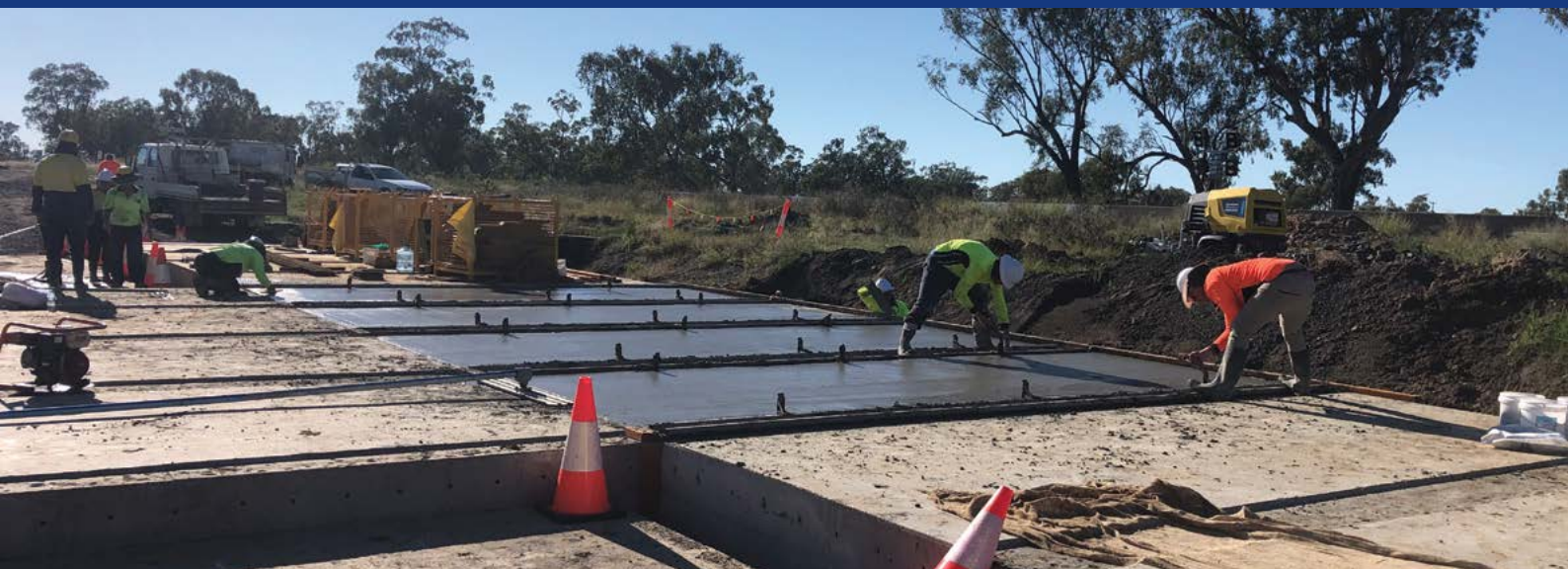
The Washpool project site April 2022