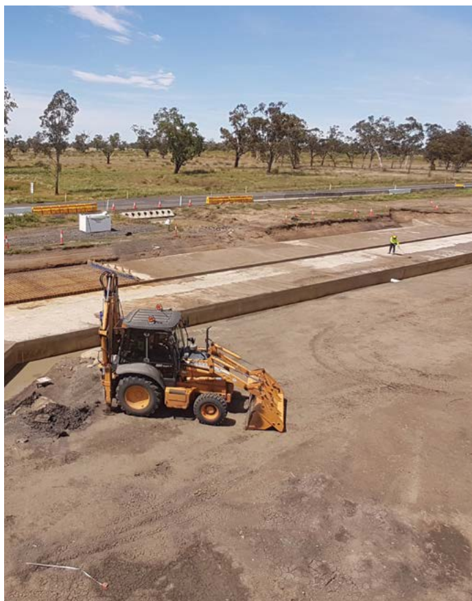
Pictured above: Works during 2021