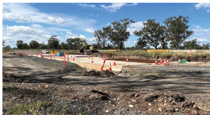
Concrete pour, April 2022