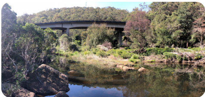
Widening is proposed as a first step for safety

This work will inform a business case that will assess the preferred options identified based on priorities and value for money. By the end of 2021, Transport will deliver a draft Strategic Corridor Plan and a draft Program Strategic Business case.