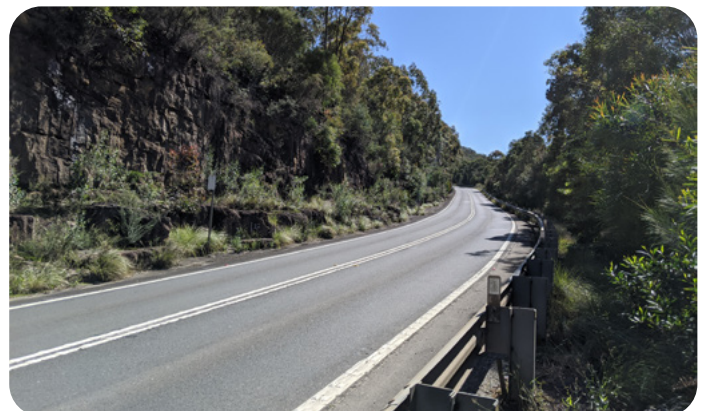
Slope stabilisation works are proposed on both approaches