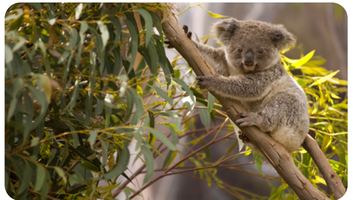
The proposal includes koala crossings at the northern and southern bridge abutments