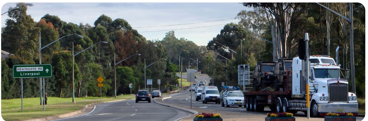
Ongoing improvements: Heathcote Road between Infantry Parade and Voyager Point