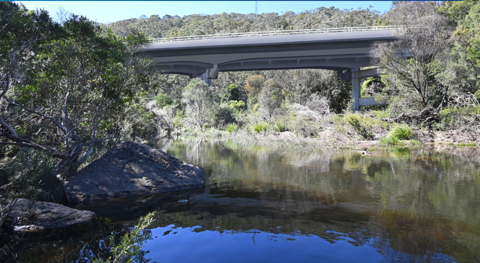
Artist impression of the proposed widened bridge

Transport for NSW has carried out an environmental assessment for the Heathcote Road bridge widening project and is inviting your comments. This Review of Environmental Factors (REF) describes Transport's proposal to widen the bridge, and includes any likely impacts that construction can have on the environment, biodiversity, heritage, soil and water, as well as mitigation measures to reduce these impacts.