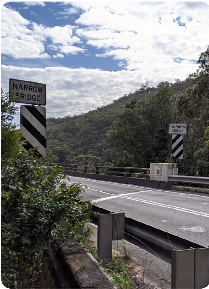
The proposal includes the widening of the bridge as well as its northern and southern approaches