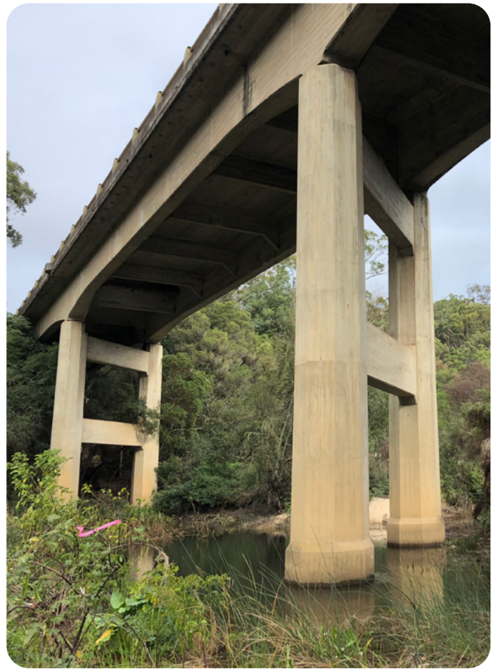
Built during World War II, Heathcote Road bridge has State heritage significance