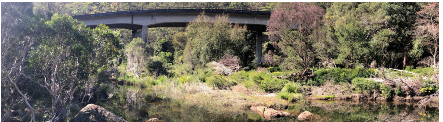
Existing Heathcote Road Bridge over the Woronora River

Built by the military during World War II to provide an easy route over the Woronora River, today over 22,000 motorists cross the Heathcote Road Bridge in Engadine daily. The bridge provides an important connection between Sydney's south, Wollongong and the South Coast to Sydney's west.