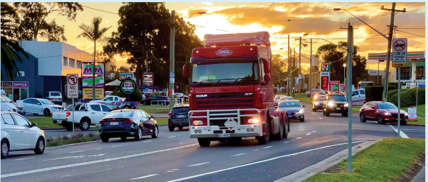
Heathcote Road at Moorebank looking north towards the intersection at Junction Road and the service road