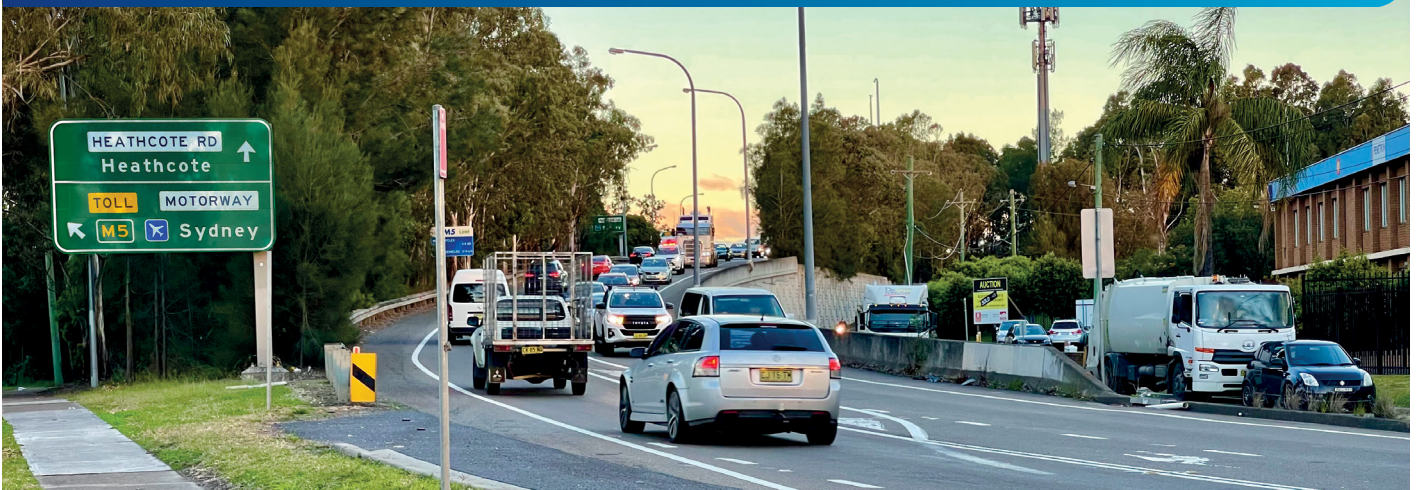
Heathcote Road at Moorebank looking south towards the M5 Motorway

Transport for NSW is investigating a future upgrade of Heathcote Road, Moorebank between Junction Road and the M5 Motorway. Improving this 300m section would improve safety and traffic flow. You can have your say on the proposed upgrade and meet our team at an online community information session on Tuesday 14 September.