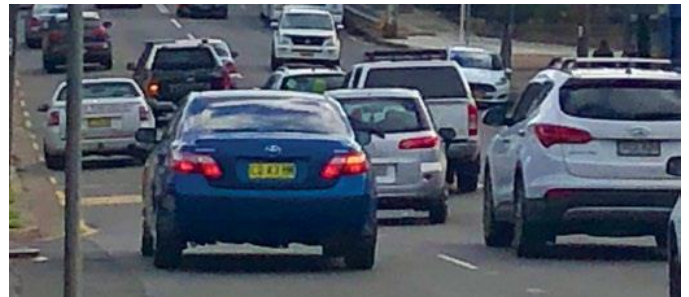
Parked vehicle in kerbside lane causing congestion

If you have any questions about the installation work, please contact our delivery partner, Ventia Boral Amey Joint Venture (VBAJV) on 1800 677 700 .