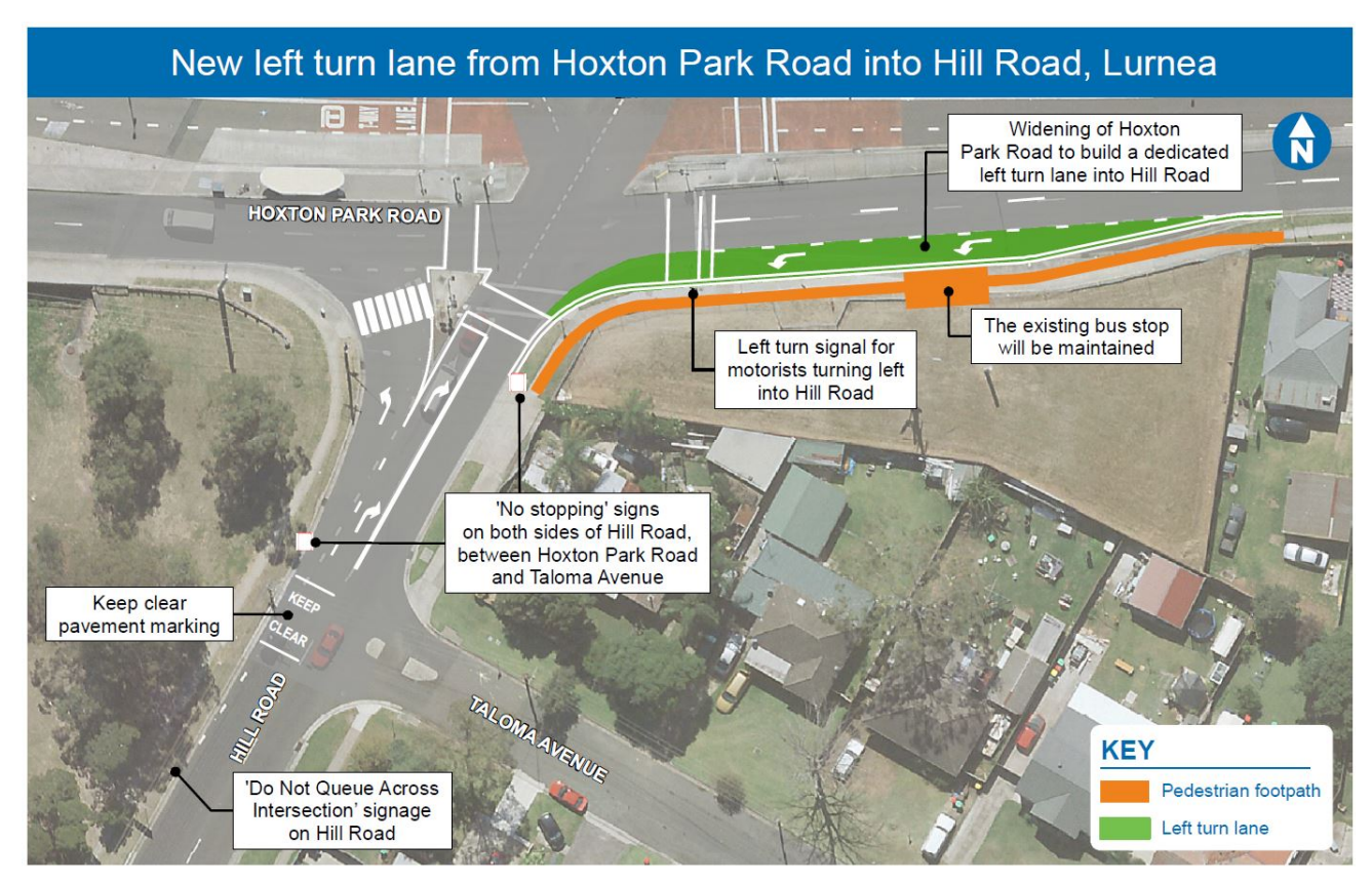
Image one: Proposed improvements on the intersection of Hoxton Park Road and Hill Road, Lurnea