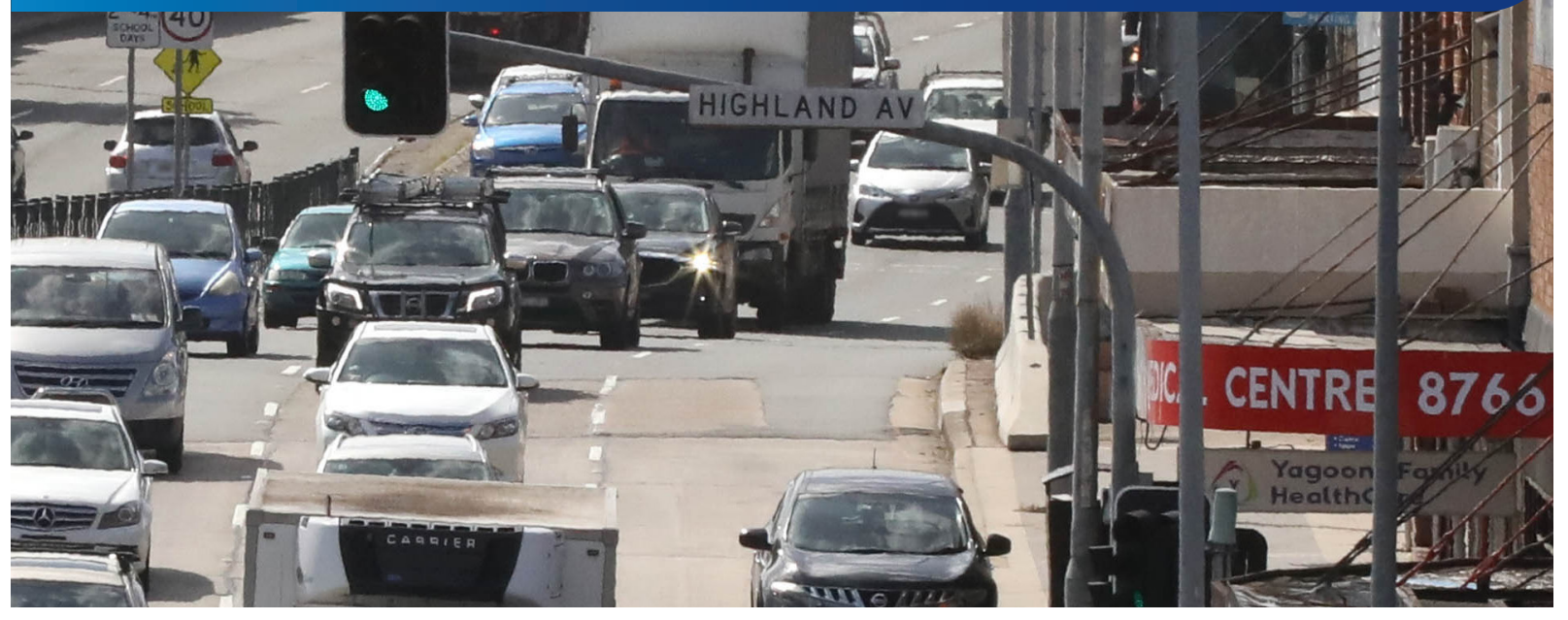
Hume Highway, Yagoona westbound