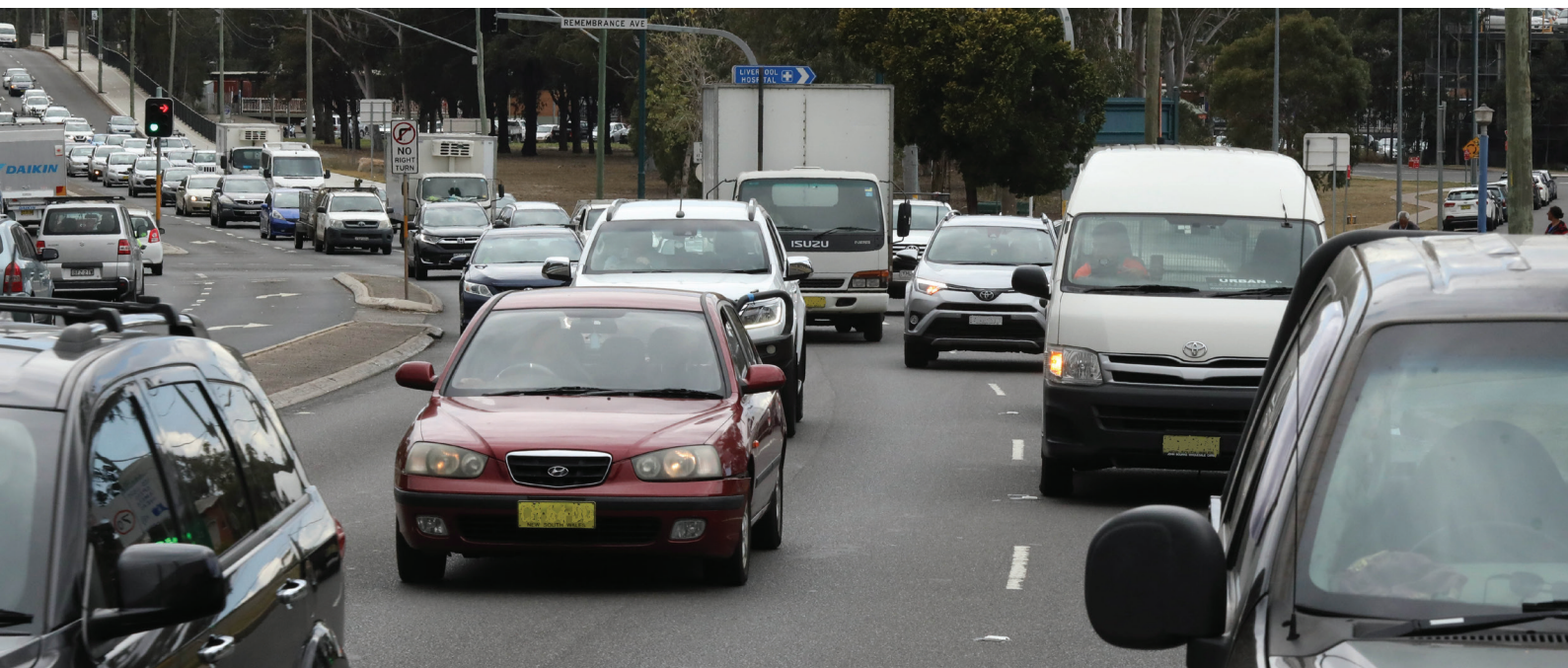
Congestion on Hume Highway

Roads and Maritime Services | October 2018