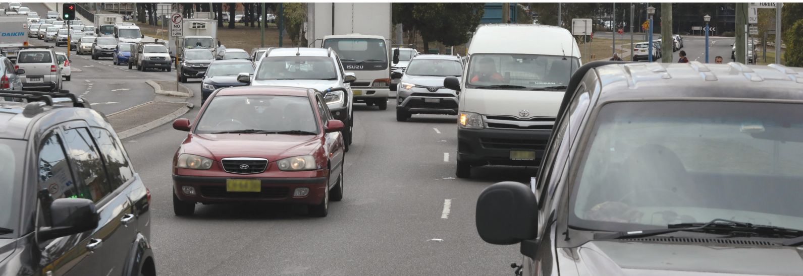
Parked vehicles on Hume Highway causing merging traffic