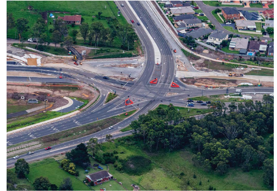
Looking north at the Bringelly Road, Camden Valley Way and Cowpasture Road intersection, Horningsea Park.