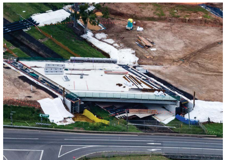
Construction of the new bridge over the Upper Canal, Leppington for Bringelly Road Upgrade Stage 1.

Western Sydney is Australia's third largest economy and in its own right would be Australia's fourth largest city. During the next 20 years, the region is expected to grow from two million to three million people, which is why the Australian and NSW governments are fast-tracking the development of new, and upgrades to existing infrastructure.