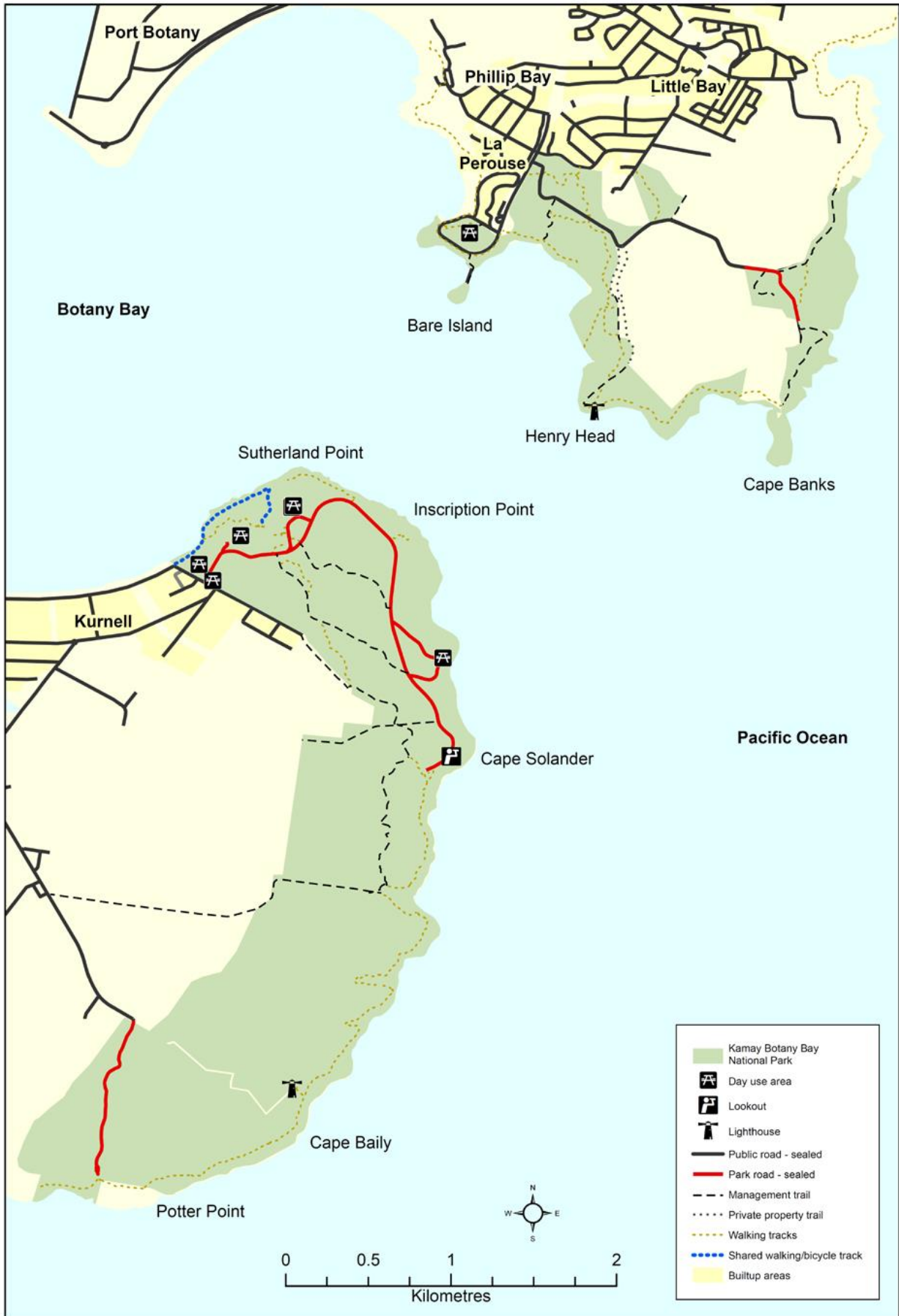
Figure 3-1: Kamay Botany Bay National Park overview (NSW DPIE, 2020a)