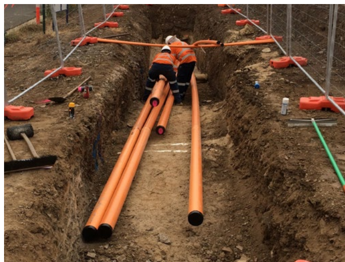
The early work program involved relocating 4.5km of cables underground

The Old Windsor Road connection provides active transport links to nearby Metro stations at Bella Vista and Kellyville. The Memorial Avenue upgrade includes a shared pathway along the entire length of the road on both sides and connects to existing shared paths at Old Windsor Road and Windsor Road.