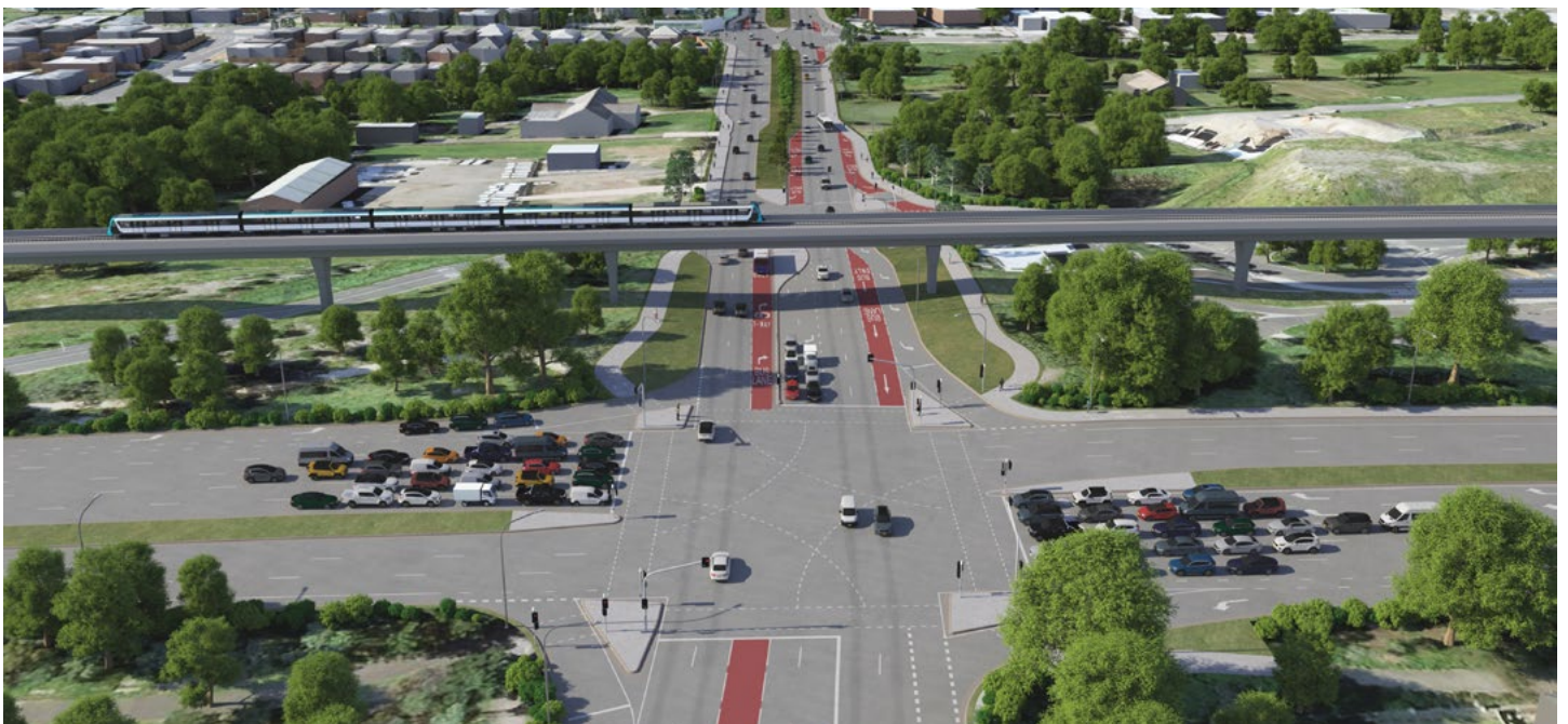
Artist impression of the new Memorial Avenue looking east

The NSW Government is upgrading Memorial Avenue to ease congestion, improve travel times and meet the future transport needs for Sydney's growing north west.