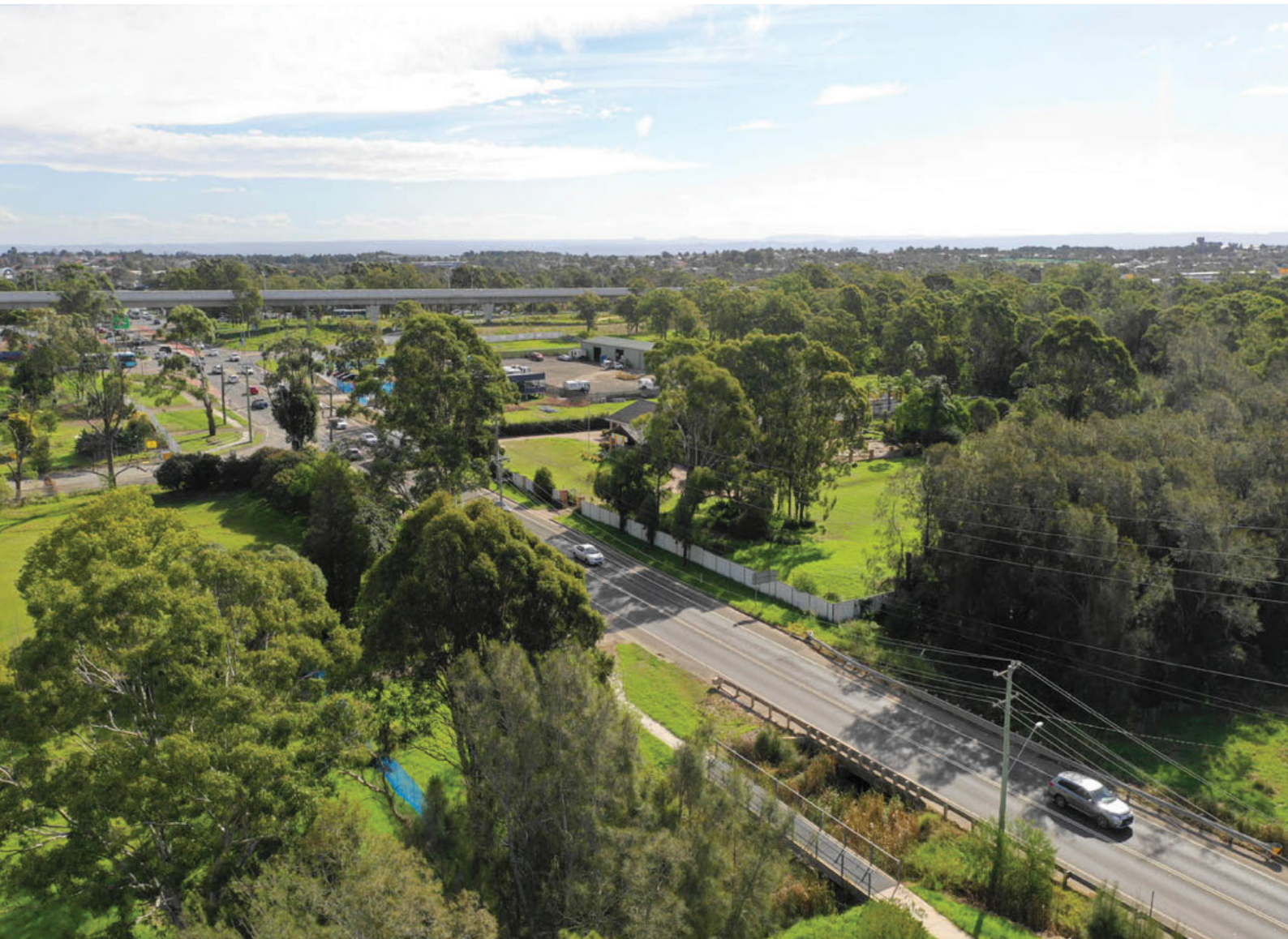
Memorial Avenue looking west towards Old Windsor Road

The NSW Government is upgrading Memorial Avenue to ease congestion, improve travel times and meet the future transport needs of Sydney's northwest.