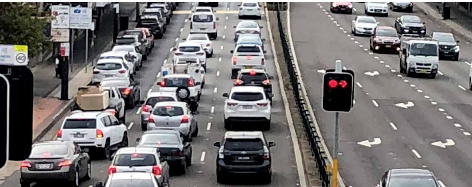
Parked vehicles on King Georges Road causing congestion

Roads and Maritime Services | October 2019