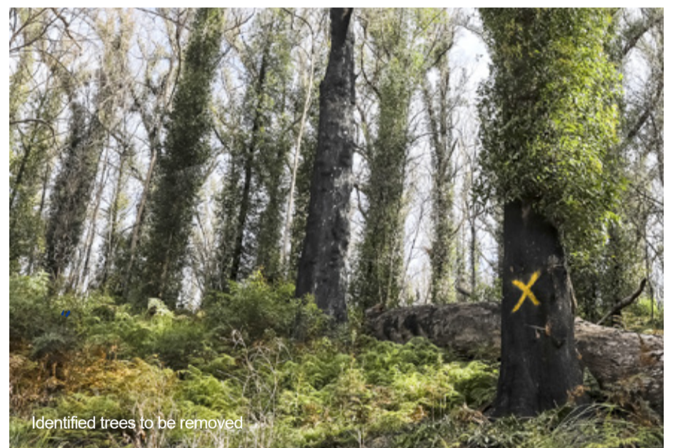
Identified trees to be removed

The closure will now be in place until early December, weather permitting. A summary of the closure is below.