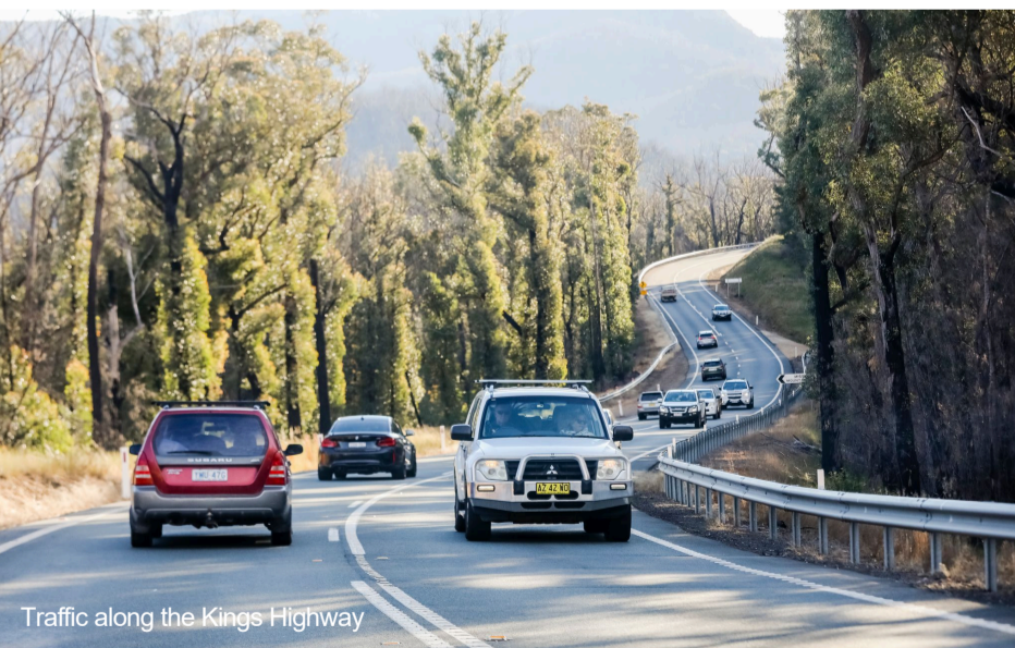
Traffic along the Kings Highway