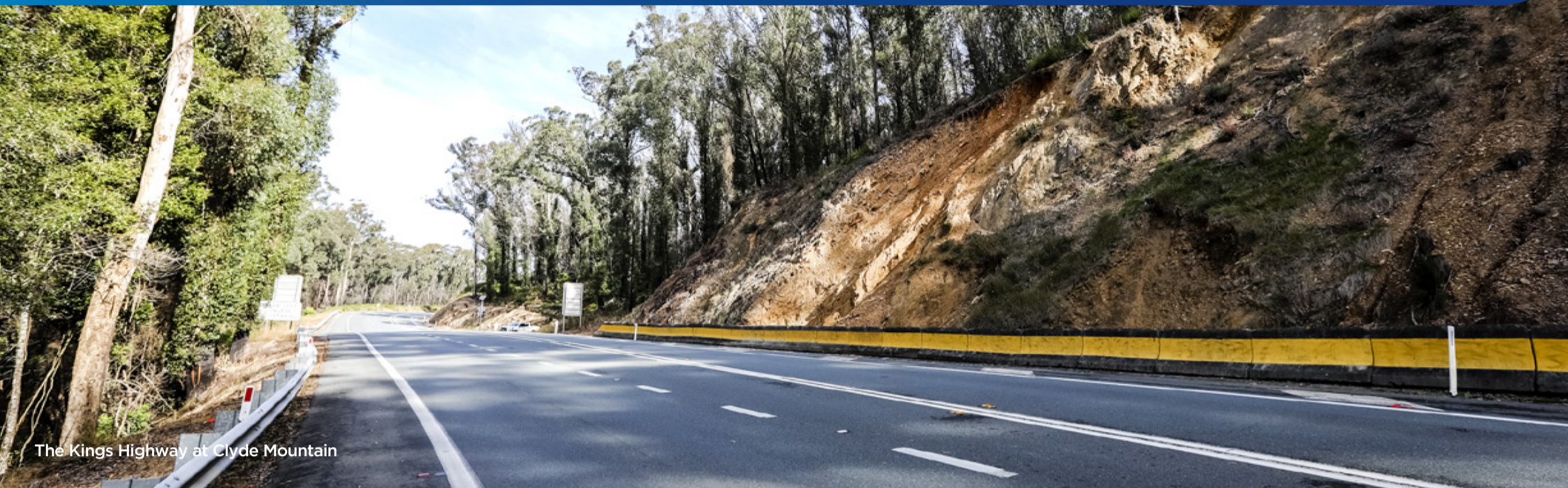
The Kings Highway at Clyde Mountain

Clyde Mountain Natural Disaster Recovery work