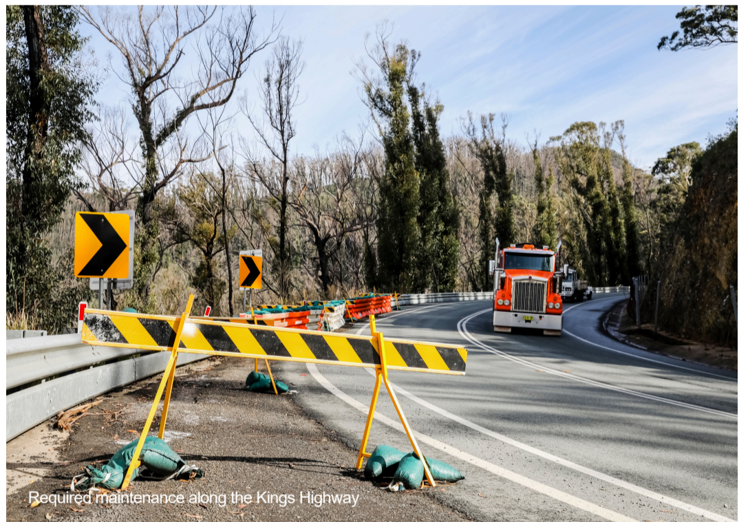
Required maintenance along the Kings Highway

Please subscribe to our mailing list to receive regular updates about the work. You can subscribe via the project webpage or by contacting us on the details below.