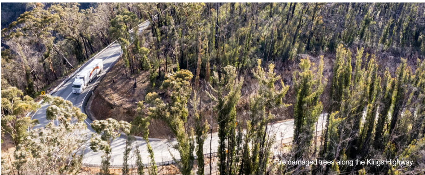
Fire damaged trees along the Kings Highway