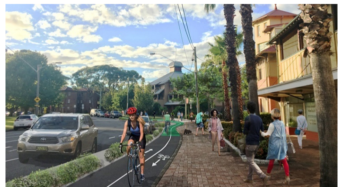
Artist's impression of improvements on General Bridges Crescent

We commenced cycleway construction on Doncaster Avenue between Bowral Street and Todman Avenue, and Darling Street and Anzac Parade.