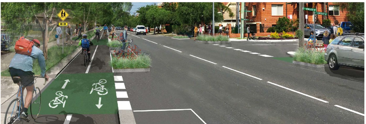
Artist's impression of improvements at the intersection of Doncaster Avenue and Carlton Street, Kensington.

You can view the plans and parking changes on the project webpage nswroads.work/k2cp .