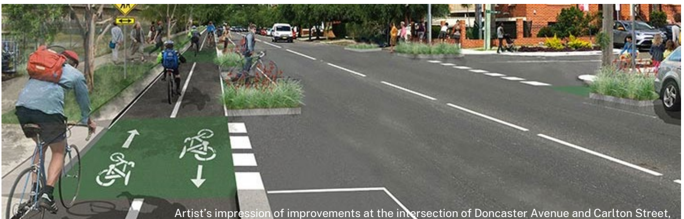
Artist's impression of improvements at the intersection of Doncaster Avenue and Carlton Street,