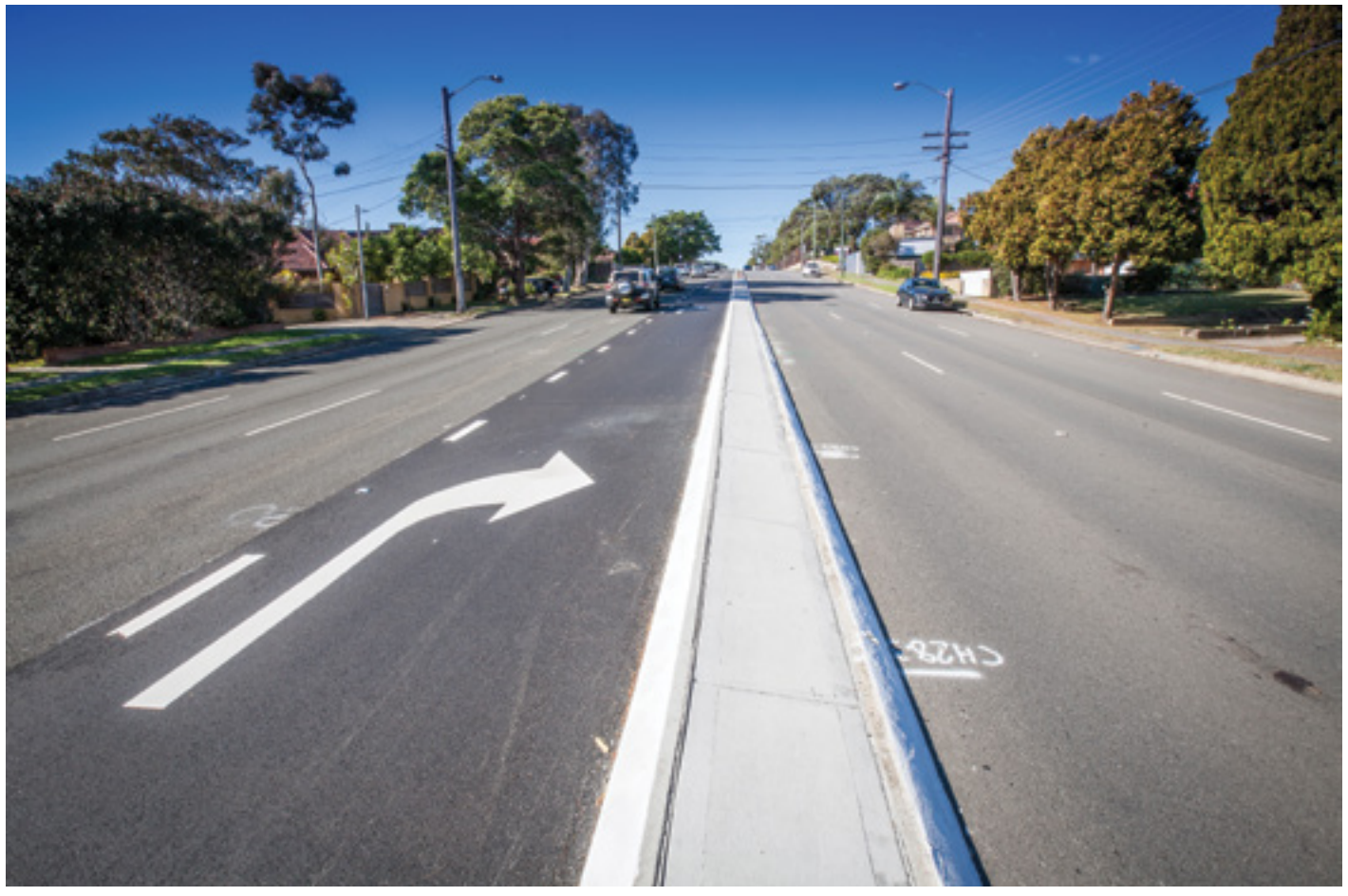
Extended right turn bay at Kingsway and Woolooware Road, Woolooware