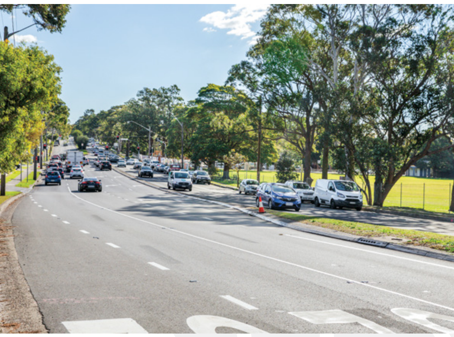
An additional right turn lane at the intersection of Kingsway and Gannons Road, Caringbah

Roads and Maritime Services | December 2018