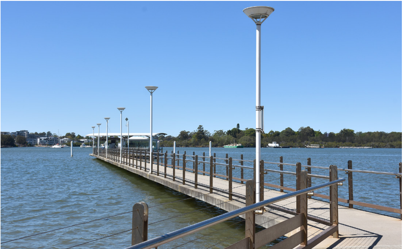
The existing Kissing Point Wharf viewed from land