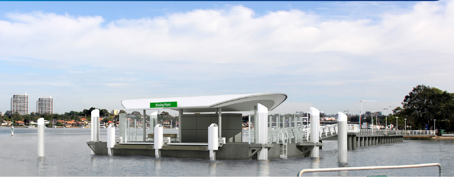
An artist's impression of the proposed new Kissing Point Wharf viewed from the water