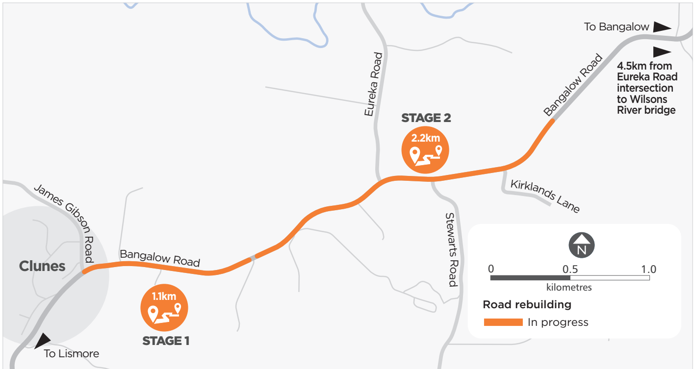
Map showing the location of work to the east of Clunes on Lismore Bangalow Road