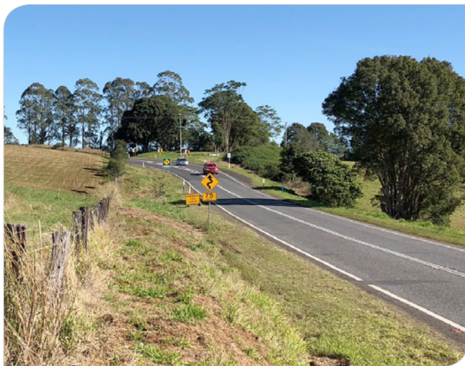
View of Lismore Bangalow Road from Stewarts Road intersection facing west

The NSW Government has provided $11 million to improve a section of Lismore Bangalow Road east of Clunes. This project will also be carried out in two stages.