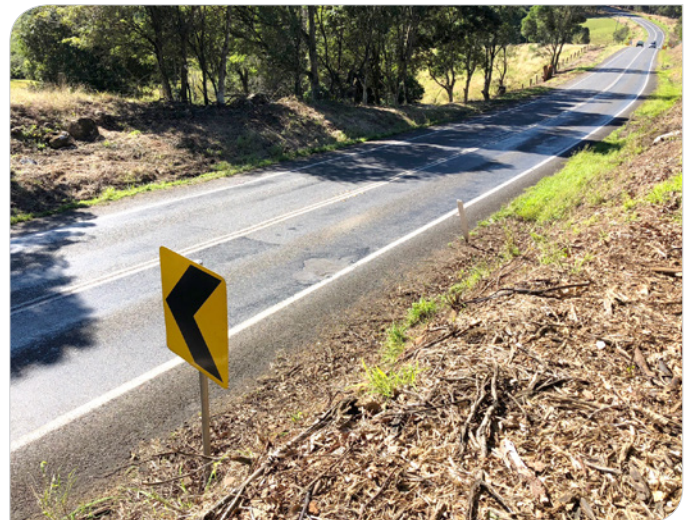
View of Lismore Bangalow Road east of Clunes

Additional features of the work will include access improvements for Kirklands Lane and Stewarts Road onto Lismore Bangalow Road. The work will also include the installation of safety barriers and road surface repairs to create a longer lasting road and improve ride quality.