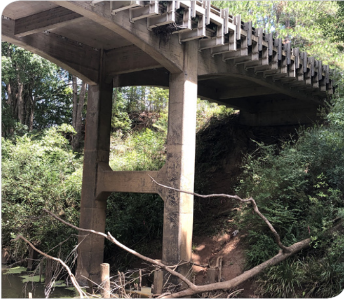
View beneath Wilsons Creek Bridge, Nashua

Vegetation clearing and work to improve bridge abutments are planned for Wilsons Creek Bridge on Lismore Bangalow Road at Nashua. We are planning to start the work in November 2019, and expect to complete the $400,000 project within six weeks.