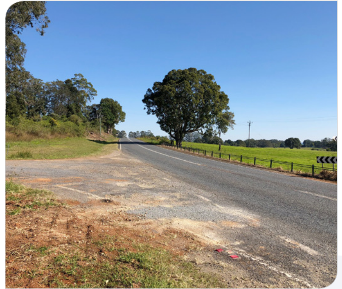
Kirklands Road intersection on Lismore Bangalow Road

Roads and Maritime continues to maintain Lismore Bangalow Road by carrying out improvements to slope stability and bridges on the road between Lismore and Bangalow, as well as improving the road surface at various locations along the corridor. This work forms part of ongoing State road maintenance.