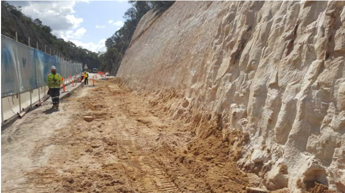
Rock cutting at the Kariong exit ramp to Gosford