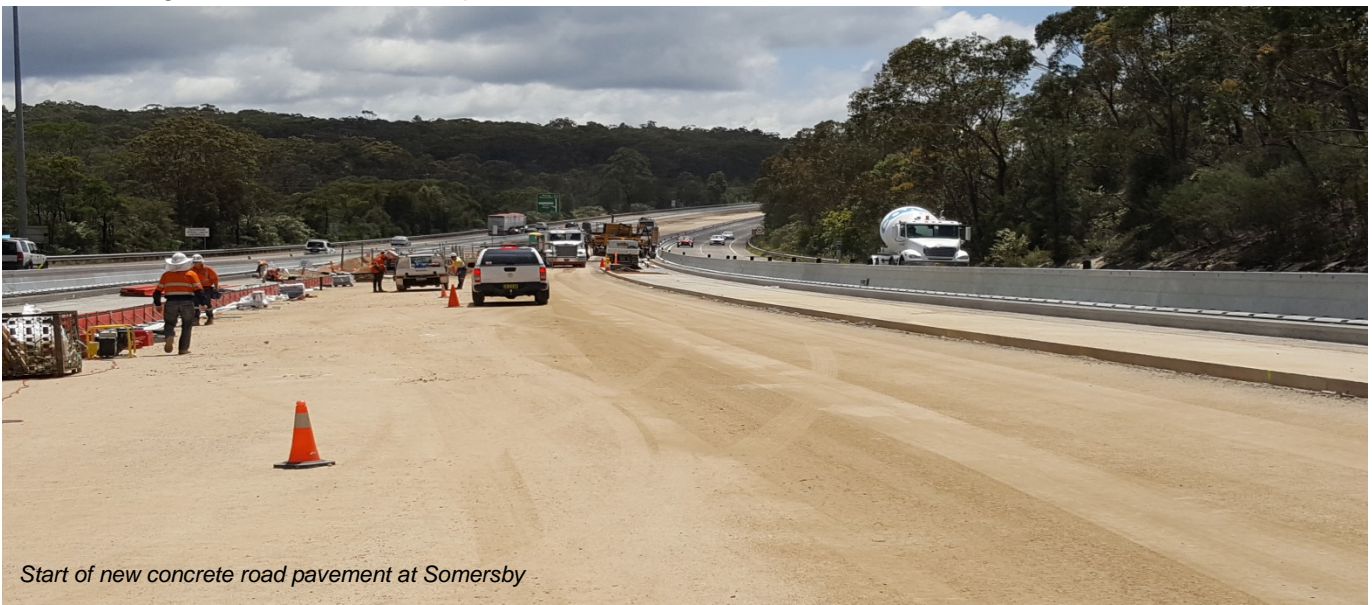
Start of new concrete road pavement at Somersby