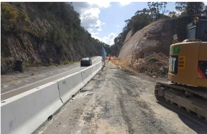
Lengthening and widening the Gosford exit ramp for two lanes