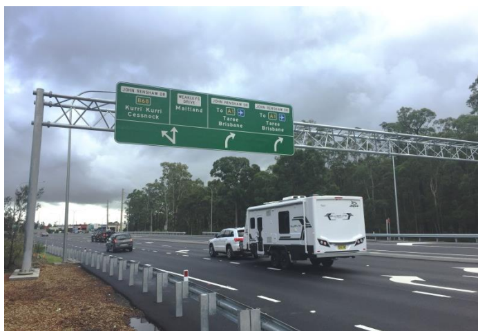
Large gantry and signs installed above M1 travel lanes

The $33.6 million upgrade makes it easier for commuters, heavy vehicle operators and holiday makers to share the road and get to their destination safely.