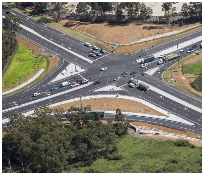
Aerial view of the completed M1 Pacific Motorway intersection upgrade at Weakleys Drive and John Renshaw Drive

During construction, the project supported 40 full time jobs with more than 10,000 tonnes of asphalt laid and accommodated 15 million vehicle movements through the project with minimal commuter delay.