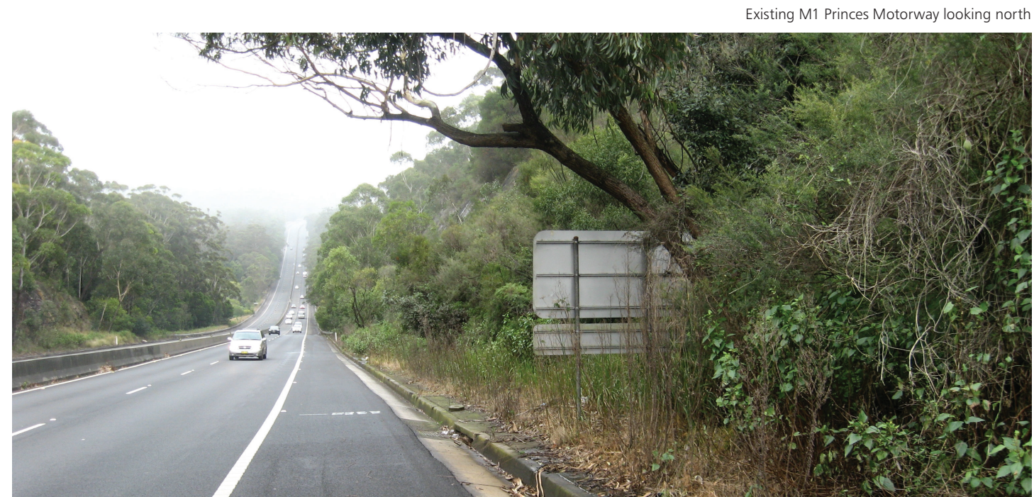
Existing M1 Princes Motorway looking north

This document contains important information about road projects in your area. If you require the services of an interpreter, please contact the Translating and Interpreting Service on 131 450 and ask them to call the project team on 02 4221 2515. The interpreter will then assist you with translation.