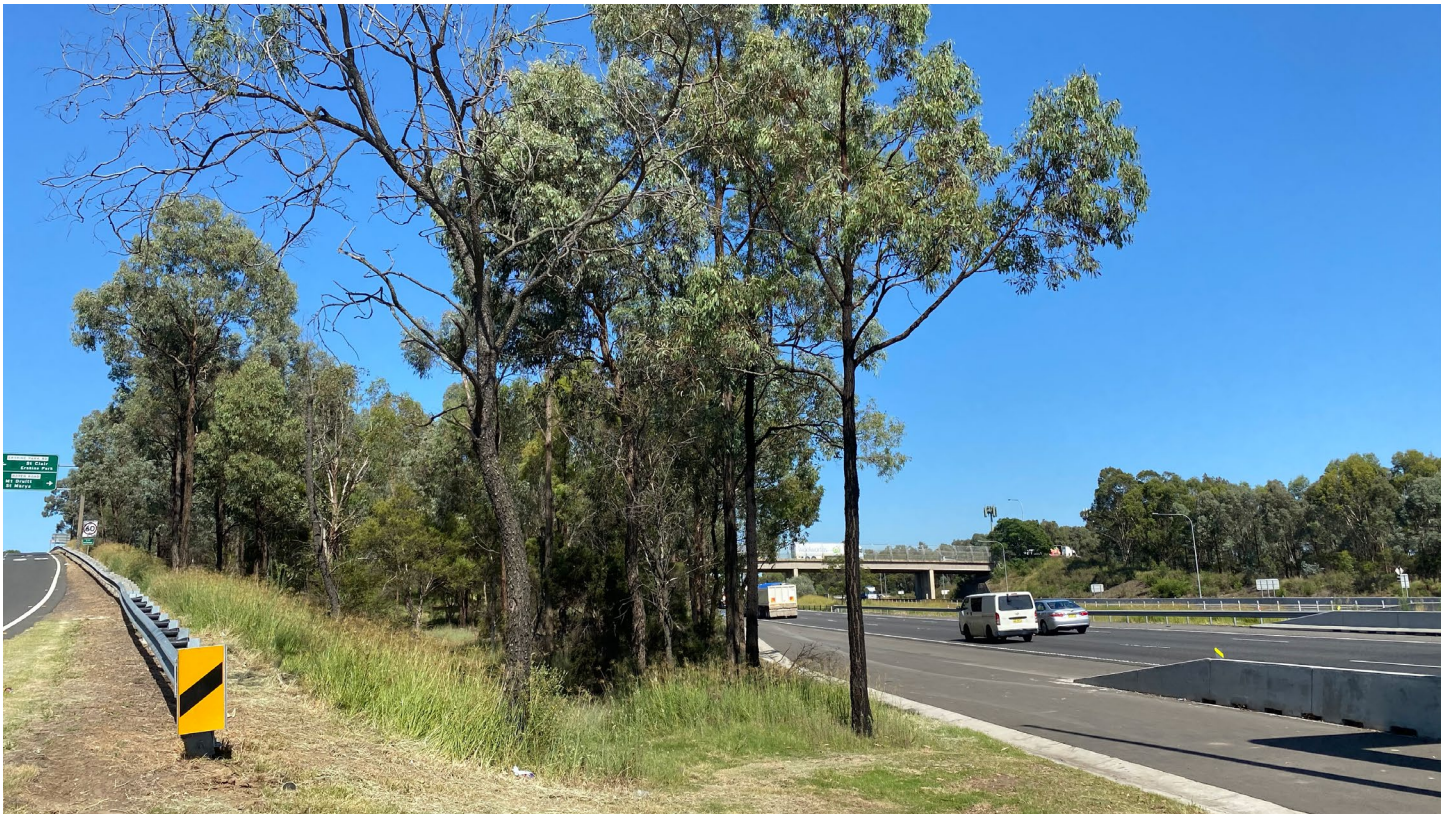
View of the early works location for the new ramp looking into the M4.