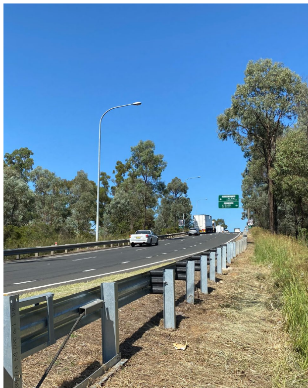
M4 off ramp approaching Erskine Park