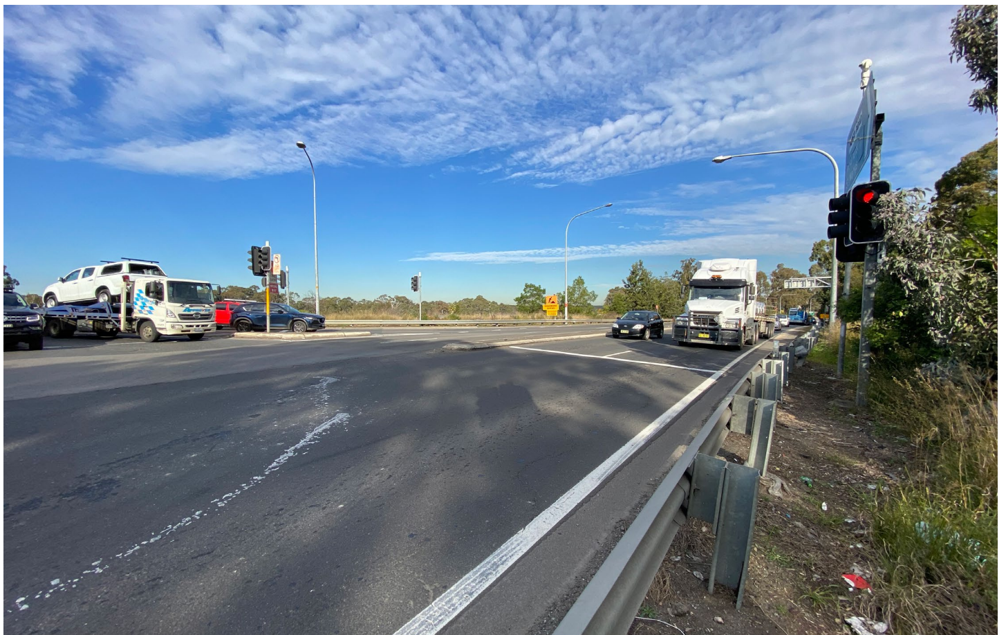
Erskine Park Road intersection at the M4 westbound off ramp

The NSW Government is funding this project to ease congestion on the M4 Motorway on ramps and local roads within Erskine Park and St Clair.